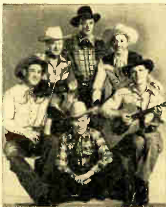
THE SONS OF THE PIONEERS

Perry Como has been booked to make a personal appearance at the Paramount Theater in New York in June. Previously booked to go on stage there with Elliot Lawrence, the booking was changed so that the Mills Brothers went in with Lawrence. Picture and other attraction have not as yet been set for the Como date.