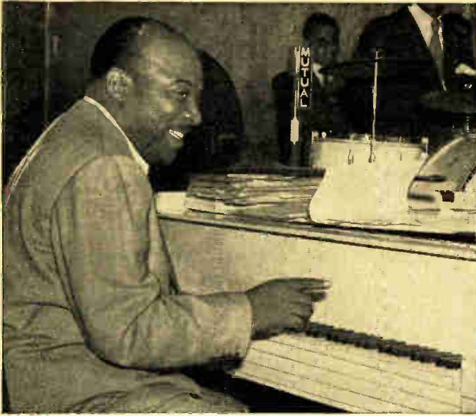
COUNT BASIE AND ORK With him, a wealth of stars.