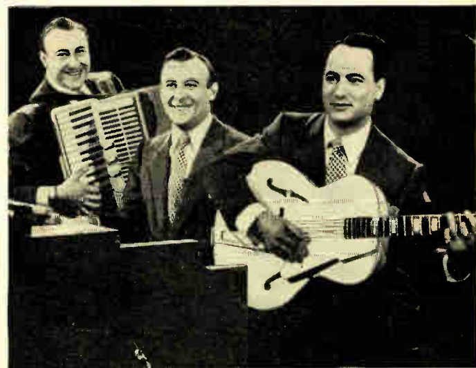
THE THREE SUNS

Perry Como recently unveiled a hitherto hidden talent on his Chesterfield Supper Club program. Como had Ziggy Elman as his guest and when the trumpeter began to play a solo it turned out to be a duet for Perry picked up a horn and joined in. He later explained that as a child he had been pretty handy with a valve trombone.