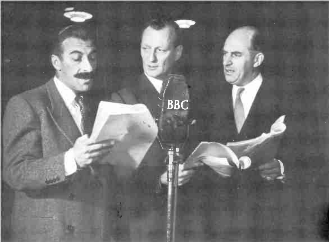
'Much Binding in the Marsh': l. to r., Sam Costa, Richard Murdoch and Kenneth Horne