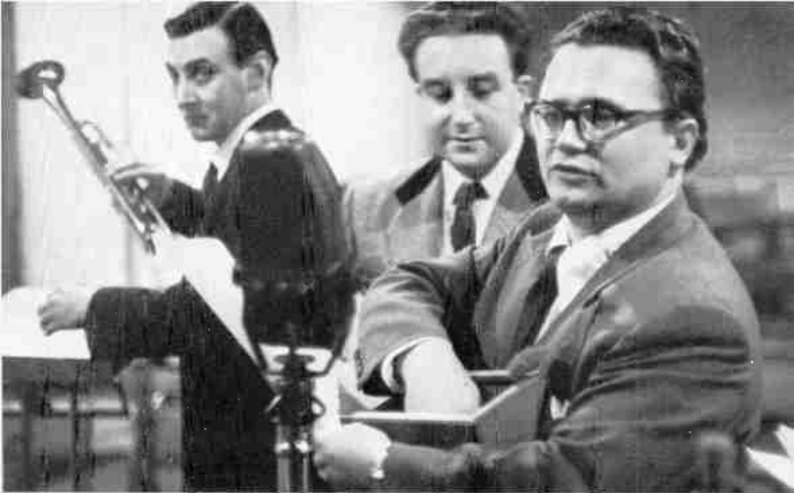
Spike Milligan, Peter Sellers and Harry Secombe rehearsing 'The Goon Show', 1952