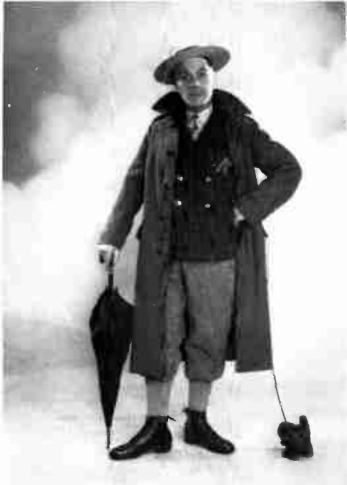
Gillie Potter, 1930