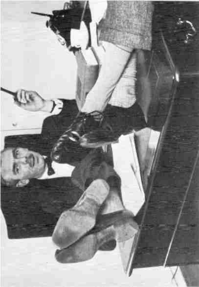
Frank Muir and Denis Norden, 1963