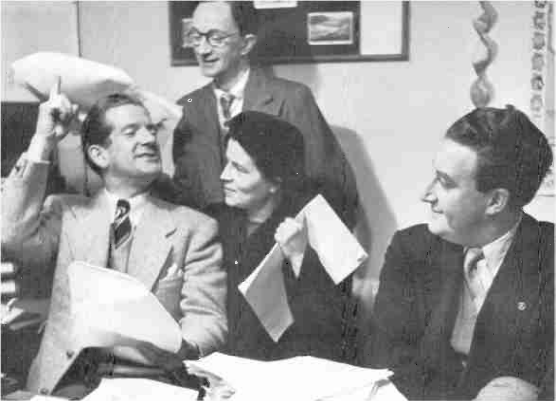
'Ray's a Laugh': Ted Ray, Charles Hawtrey, Patricia Hayes and Peter Sellers, 1953