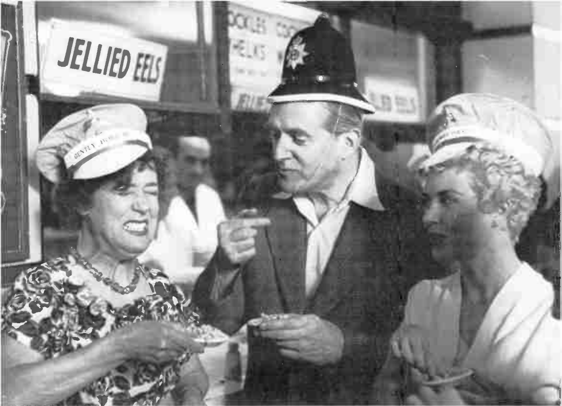
The Huggett family: