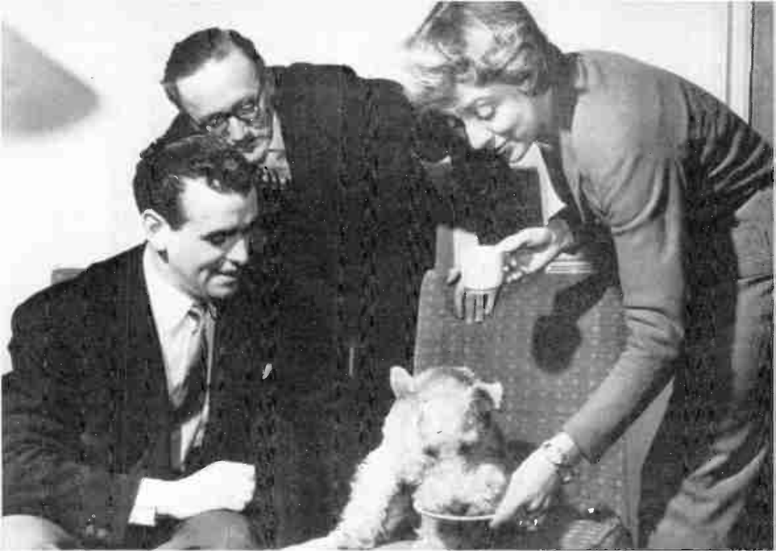
'A Life of Bliss': L to r., George Cole, Colin Gordon and Diana Churchill