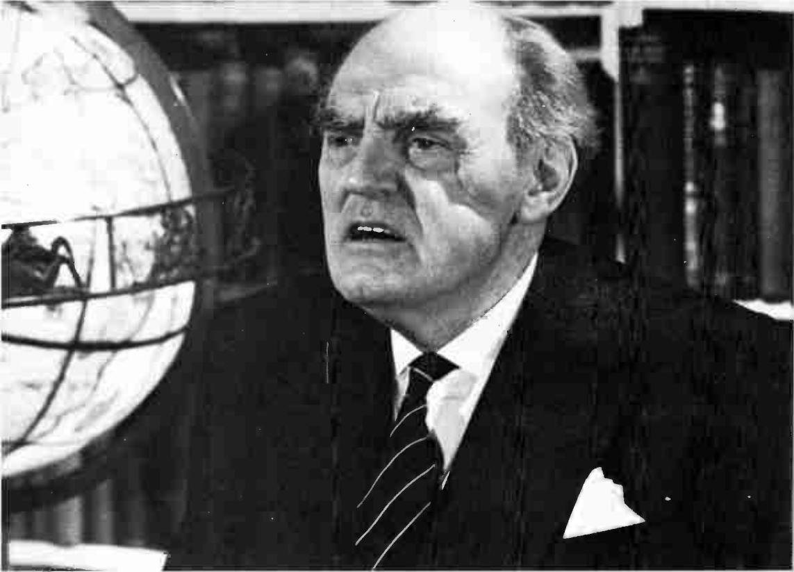
Lord Reith, 1967