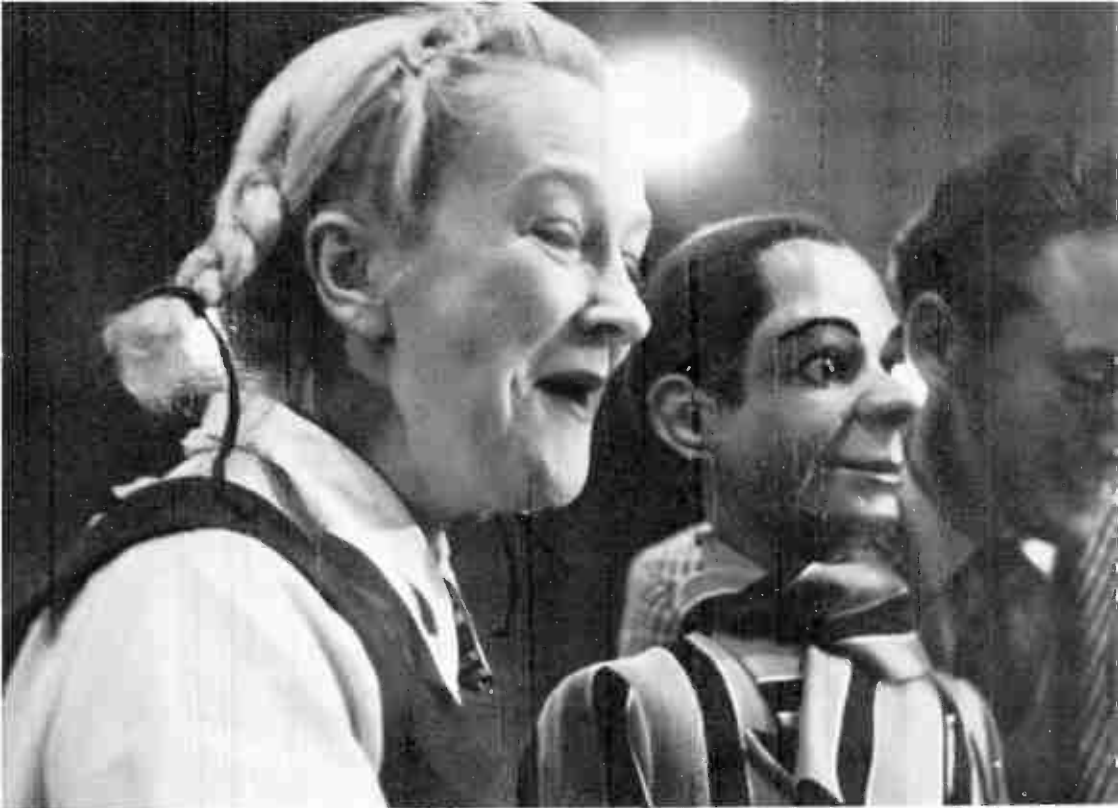
Beryl Reid, Archie Andrews and Peter Brough in 'Educating Archie', 1953