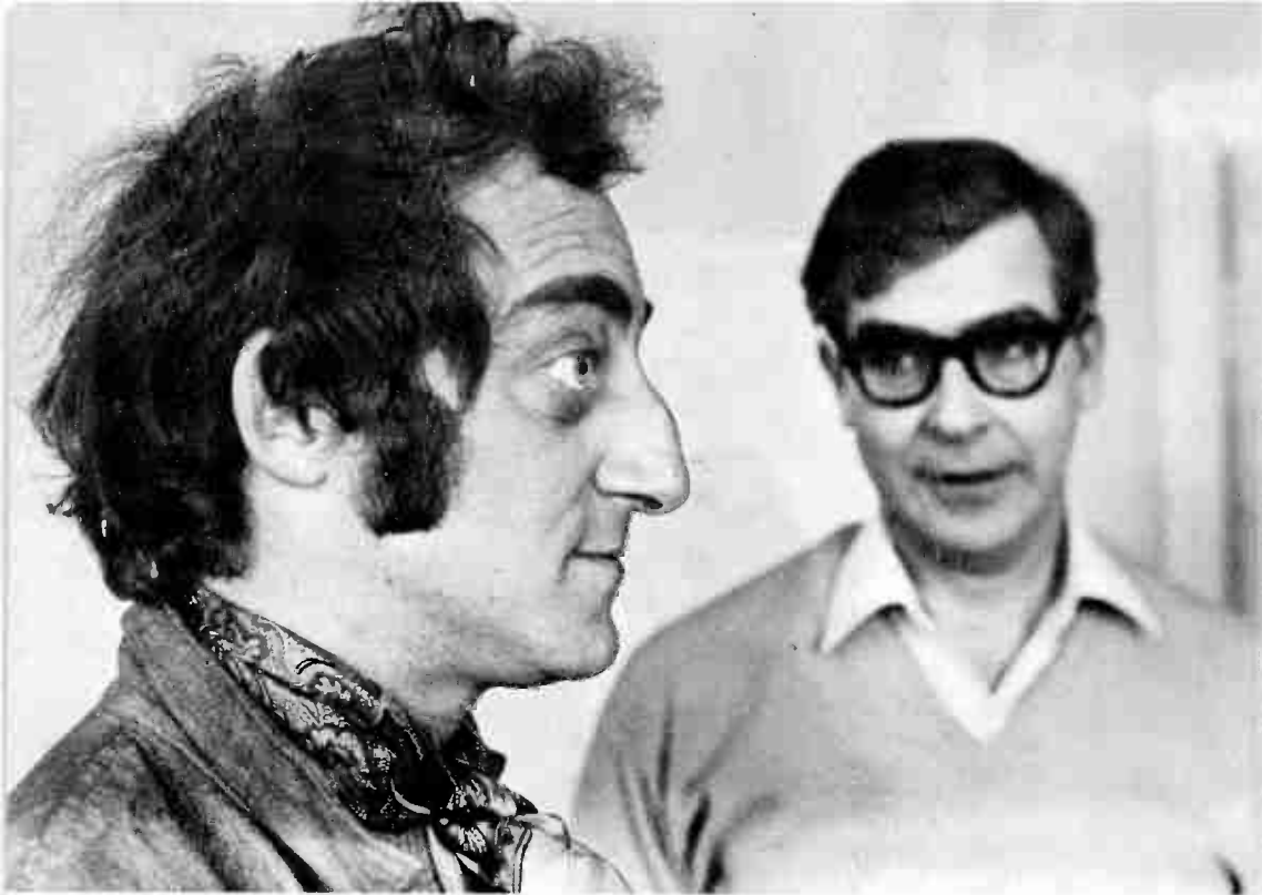
Marty Feldman and Barry Took, 1968