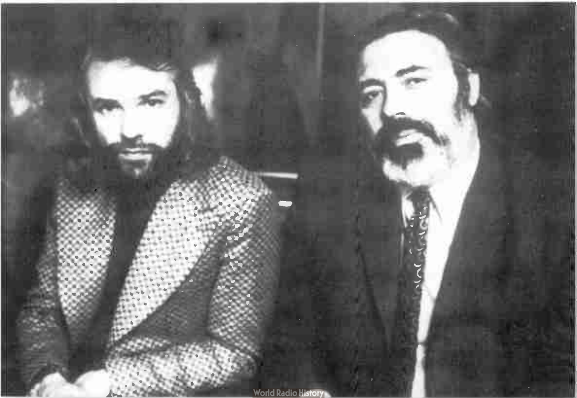
Ray Galton and Alan Simpson