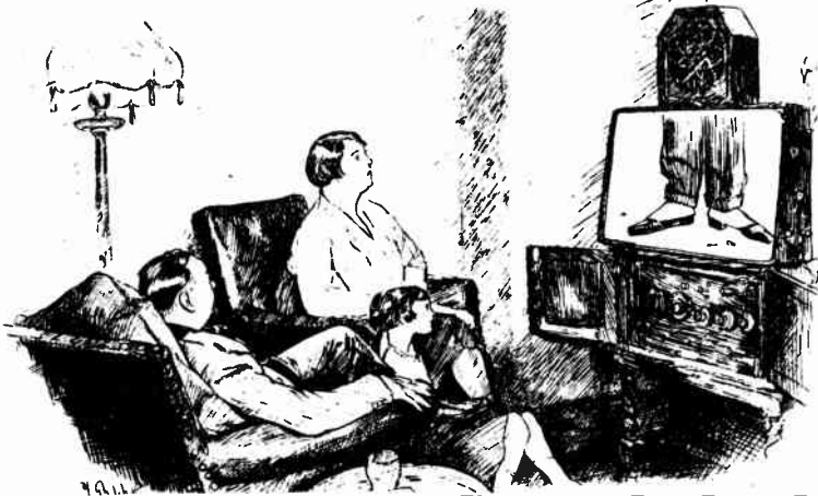
1928 caption. - WHAT OUR TELEVISIONISTS MAY HAVE TO PUT UP WITH. Voice of Broadcasting Lecturer. "Now I will run through the Lithuanian vowel-sounds once again, and this time I want you all to watch my lips closely."

It's easy to forget, incidentally, how closely television followed upon radio's heels. However, though John Logie Baird first demonstrated television in January 1926 (a year before the BBC became a Corporation), in the late 'twenties and 'thirties television was still in the province of speculation—when it wasn't merely a joke. Radio was the thing.