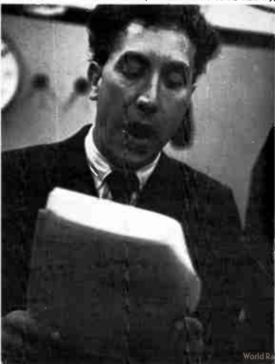
Frankie Howerd, 1952