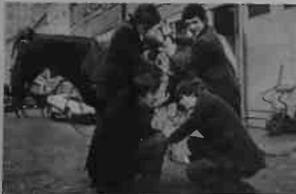
Must make sure the horse is the right size for us.

BILLY FURY'S a boy with one hobby. Animals. He has so many