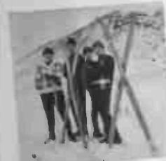
Swinging Blue Jeans