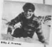
Billy J. Kramer