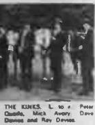
THE KINKS. L to r Peter Dinklage, Mick Avory, Dave Davies and Ray Davies.