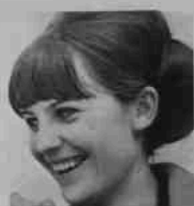
Sandie Shaw with her new hairstyle.