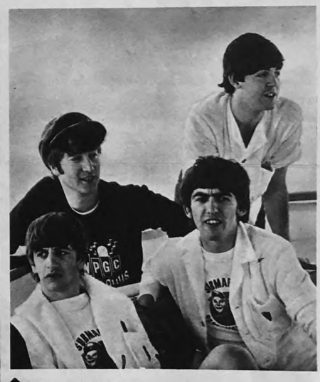
Having a wonderful time. Every day a sun-day in Florida.