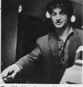
The odd lord drops in now and then, to keep up the tone of the place, e.g. Screaming Lord Sutch