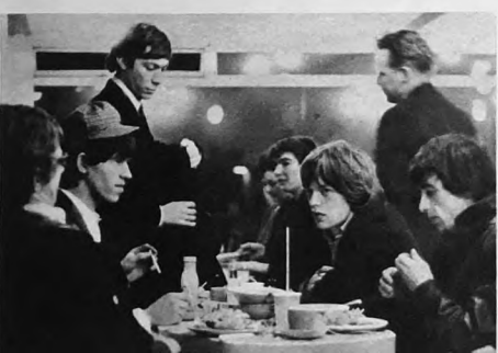
eues up for a -charming fella, this one!

The coach that you can see turning in from the M1 may carry a still-swinging jazz band, or a whole show of stars trying to snatch a quick meal before moving on to the next town on tour. They'll probably arrive at the theatre tomorrow about five after a day of travelling (or a few hours sleep) feeling absolutely ravenous, knowing Continued on next page