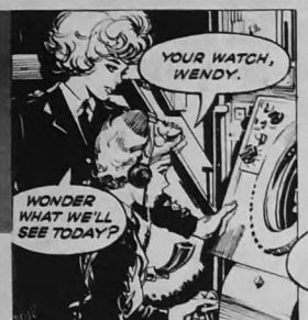
THESE ARE THE TIMES OF FIRING MAKE SURE THE AREA'S CLEAR.