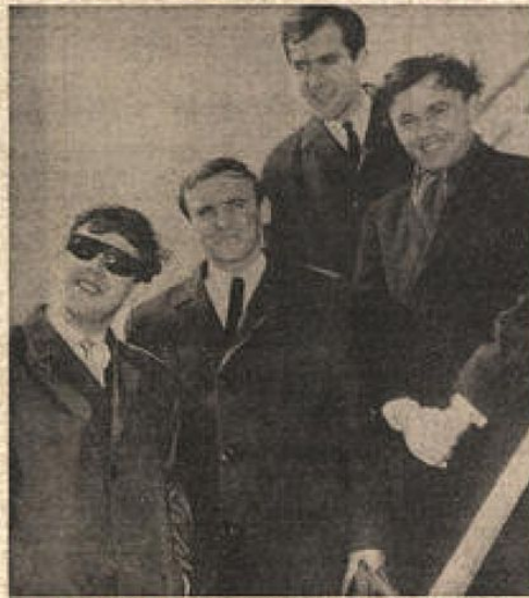
GERRY AND THE PACEMAKERS arrive tired but excited in New York on Friday.

Sullivan was pleased, Gerry and The Pacemakers were happy and now—just you wait and see, it shouldn't be long before this Liverpool group has carved a firm niche for itself in the American charts.