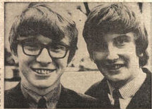
PETER AND GORDON—public schoolboys turned pop stars.

With that, the pair made a casual exit from the main entrance of the theatre, neatly avoiding fast swarming round the stage door. They were off to tackle steaks at an expensive Manchester restaurant.