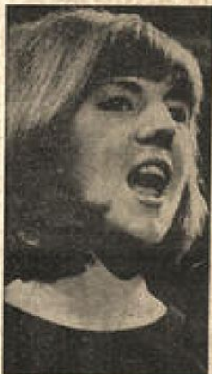
CILLA BLACK—she's got a "gorgeous number by John and Paul" up her sleeve.

IN spite of the fact that "Heart" hit the Number One spot for Cilla Black and that she told me last week that she preferred her new one, "You're My World" to it, I've a sneaking feeling that the disc she REALLY wants to do well is one she has up her sleeve.