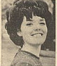
BILLIE DAVIS — Friends with Jet.

should think before the year's out, we'll have set up our own publishing company." But before all this Brian Poole and the Tremeloes have one more hurdle to jump. Next weekend, Brian and the boys embark on their first ever theatre tour, with Roy Orbison, Freddie and the Dreamers and The Searchers. "We only played our first theatre date at the Great Yarmouth Aquarium two weeks ago," says Brian. "It was fun—but frightening. Towards the end of 'Twist And Shout' every one started rushing the stage; it happens in dance halls, but we never thought we'd experience it at a theatre. "Heaven help us, and the tour, it is happening again. "But in all fairness. Although we're excited about our first tour, we're even more pleased that we're going out on the road with other groups we know and like. And as we'll be going on stage before Roy Orbison, all of us are just dying to see his act. I believe it's a knockout!"