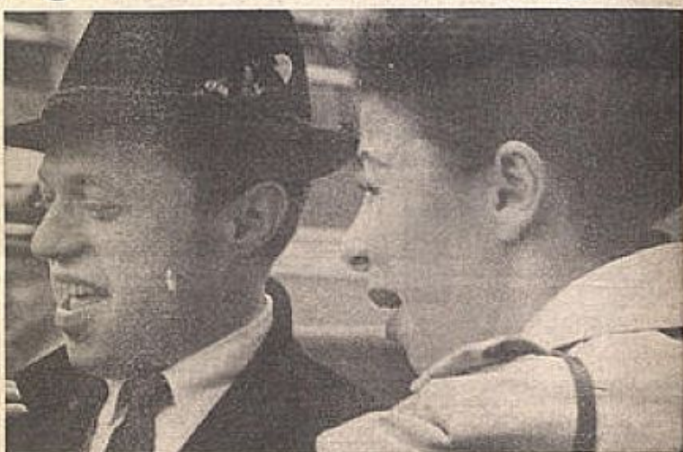
Solos and duets from STEVE LAWRENCE and EYDIE GORME.