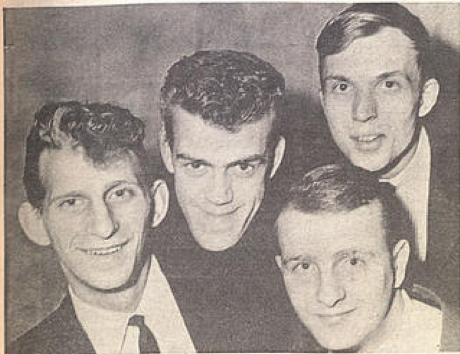
THE SPOTNICKS—a road-up of some of the recent hits by Sweden's top international group.