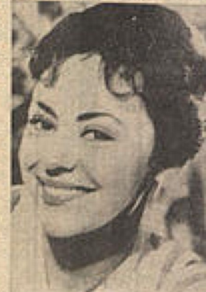
CATERINA VALENTE—One of the greatest talents in the business.

RAY ELLINGTON —Too Old To Cut The Mustard; She Lied (Ember EMB 5 172)****—Despite the title, there's a slick beat to Ellington's novelty Too Old To Cut The Mustard. Girl group chants with him on this amusing deck which will get dancers going. She Lied