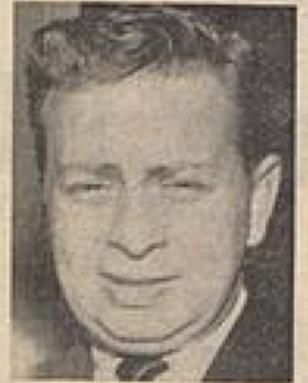
MEL TORME —In demand

Jane Morgan and Kapp Records have come to a friendly agreement to part company after several years and many very successful discs, including her biggest hit, "Fascination." Jane has not yet decided whom she will join, although she has received several good offers.