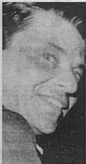
★ FRANK SINATRA —Nobody can match him in interpretation.

CLIFF RICHARD AND THE SHADOWS Me and My Shadows (No. 3) Tell Me; Gee Whiz, It's You; I'm Willing To Learn; I Love You So; I Don't Know.