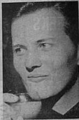
PAT BOONE . . . back in the million selling class?