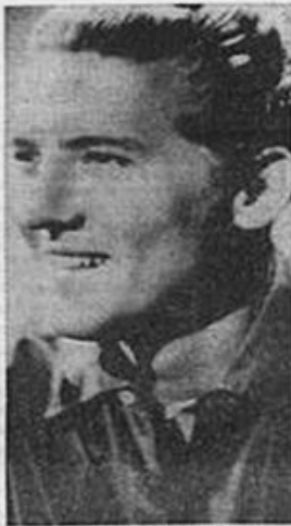
JERRY LEE LEWIS... more influence on today's pop stars than any other artist.