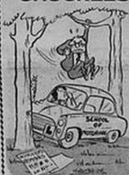
You're Driving Me Crazy