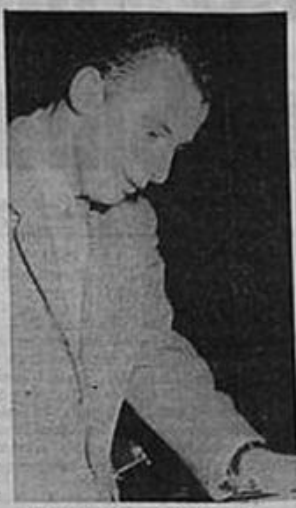
VICTOR FELDMAN ... certainly the best soloist on the record.

If adults are to be encouraged to take an interest in highly technical music, their normal adult instincts and comforts must be catered for. Let us hope that, eventually, every club will endeavour to encourage a wider audience for, and consequently, appreciation of, modern jazz than at the moment.