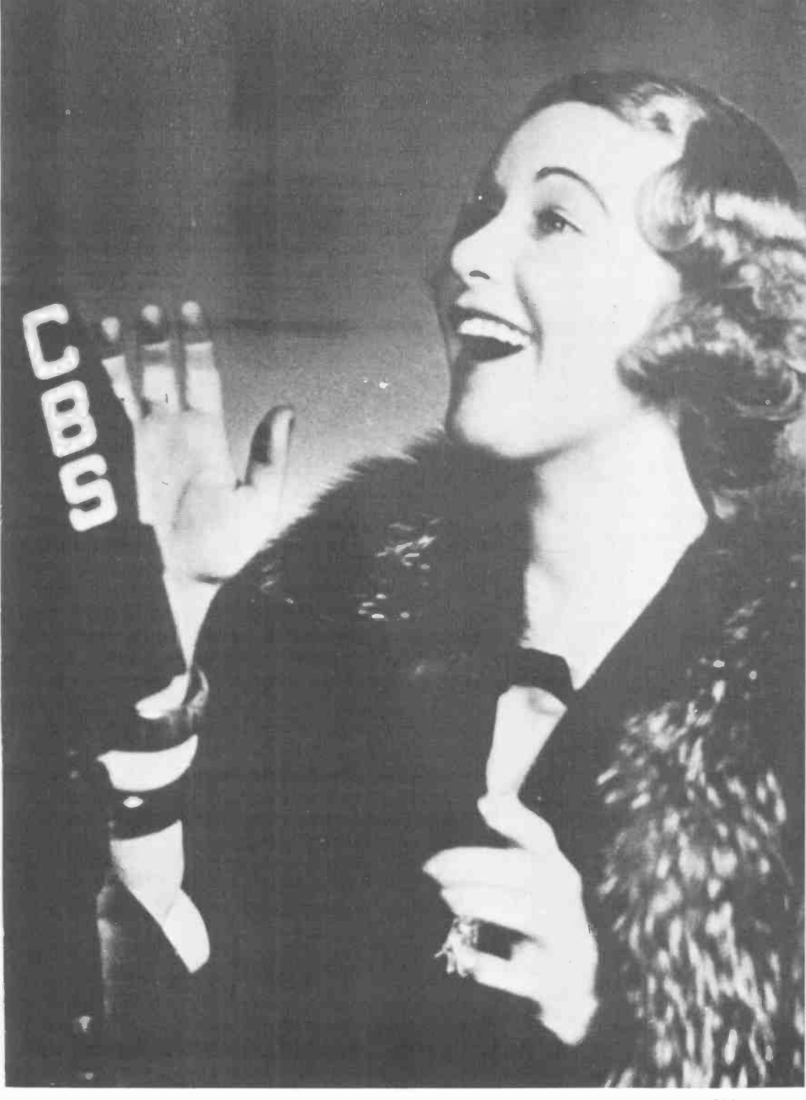
Opera star Grace Moore in 1937.