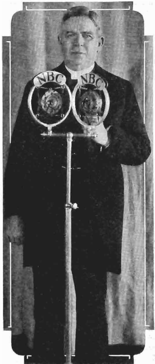
DR. S. PARKES CADMAN

Dr. Cadman receives thousands of letters each week from members of his congregation throughout the country asking his advice on almost every subject imaginable. He tries to answer as many of these letters as possible.