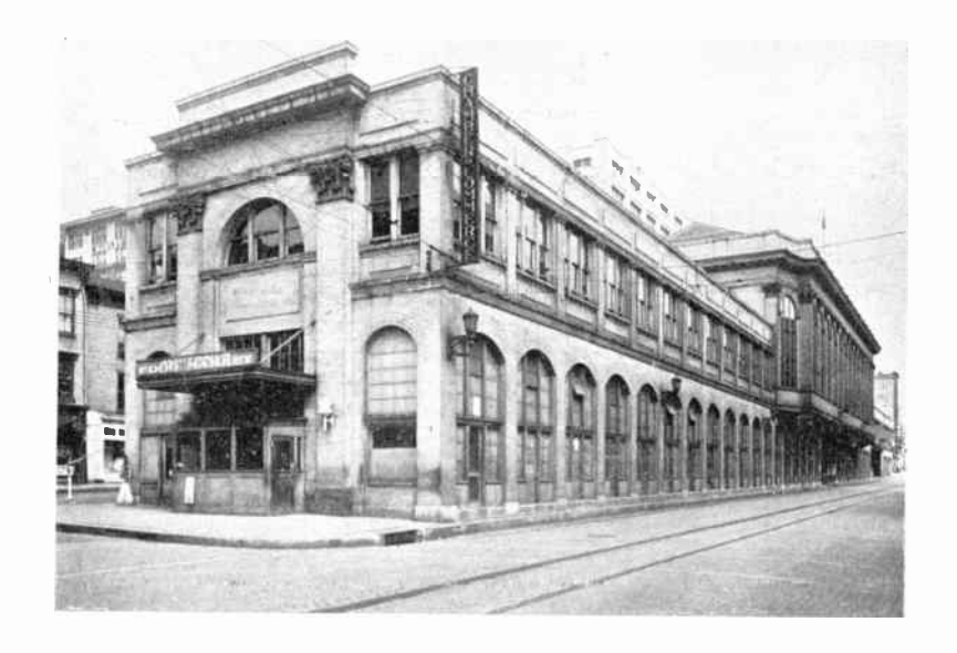
FAMOUS WHEELING MARKET AUDITORIUM

nown wherever folks listen to WWVA, the Wheeling Market Auditorium has long since become an important factor in the presentation of WWVA Jamborees. It is here that Jamboree fans come from miles around every Saturday night to cheer and applaud their WWVA entertainers. Young and old, rich and poor, have found within its informal walls something that drives away the cares of life and creates a common level of neighborliness.