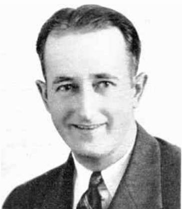
The man in the glass box.