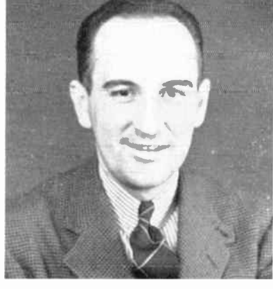
Known to Jamboree fans for his smile