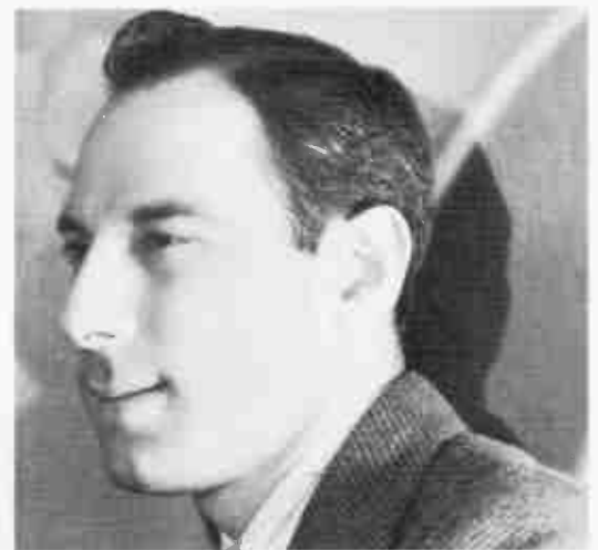
Bill Stern is the ace sports announcer of NBC who levels knowing eyes the country over on every field of sports.