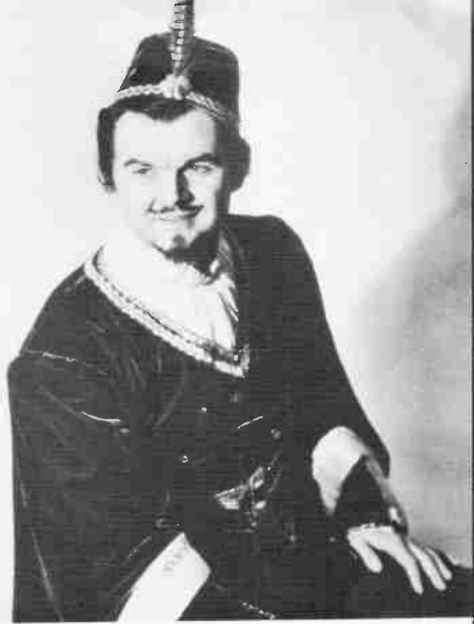
Lawrence Tibbett is one of the famous stars heard on the Metropolitan Opera broadcasts. Here, Tibbett is made-up for his role of IAGO in Verdi's OTHELLO.