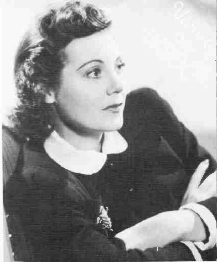
This lovely girl plays the featured role on the popular daytime serial, 'Bachelor's Children'.