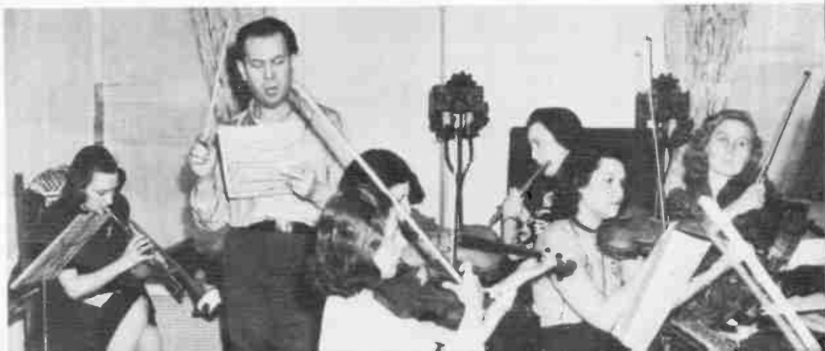
In a decidedly informal manner, Phil Spitalny conducts rehearsals for the HOUR OF CHARM. Spitalny and his all-girl orchestra are headliners on this program heard over WSOC-NBC each Sunday evening.