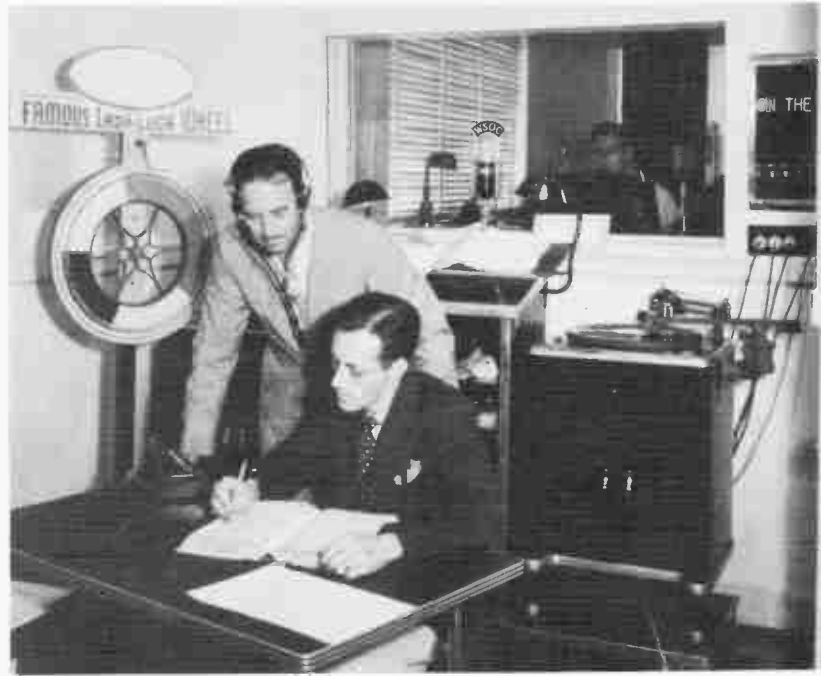
The page and column are found. Now all that matters is to decide which name to call. This also is guided by the spinning of the wheel.