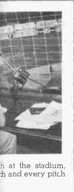
h at the stadium, h and every pitch

ional Broadcasting Company, vents are brought to WSOC ne . . . no stone unturned . . er's desire for news of sports