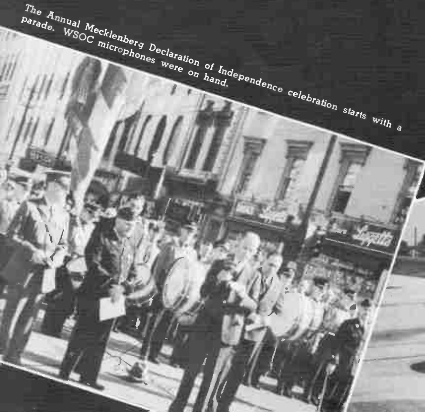
The Annual Mecklenberg Declaration of Independence celebration starts with a parade. WSOC microphones were on hand.