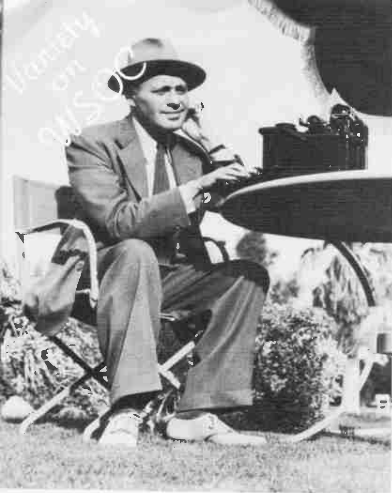
That very popular comedian Jack Benny seems a bit frustrated in the act of looking for new gags . . . or maybe he's trying to remember just where he misplaced Joe Miller's book.