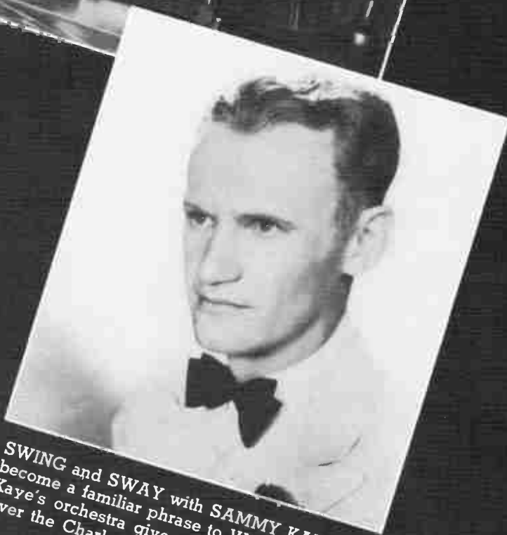
SWING and SWAY with SAMMY KAYE has become a familiar phrase to WSOC listeners. Kaye's orchestra gives regular performances over the Charlotte station.