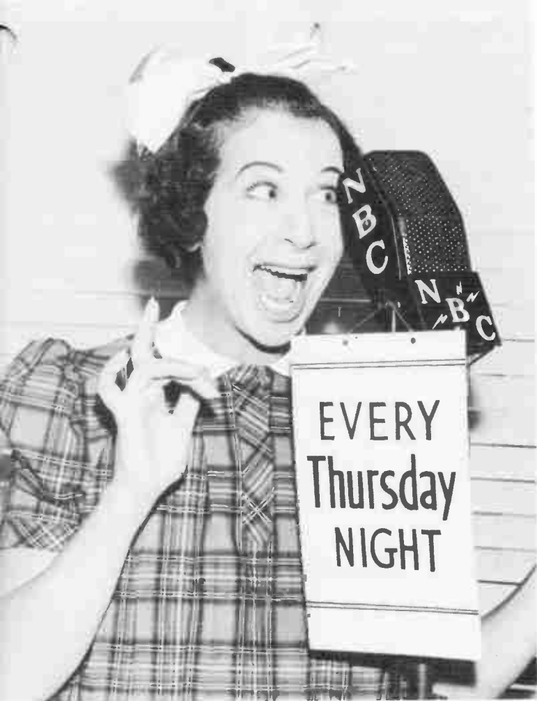
Snooks, otherwise known as Fannie Brice, is thinking up new devilment for her Daddy on the GOOD NEWS program.