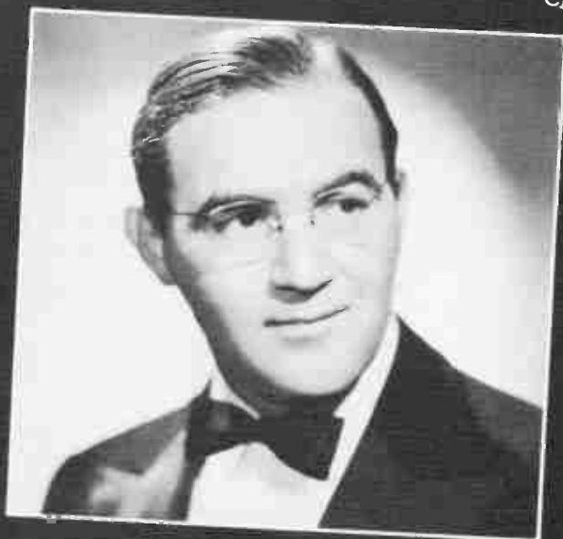
Clarinetist Benny Goodman often brings his band before NBC microphones and entertains music lovers of the Charlotte station.