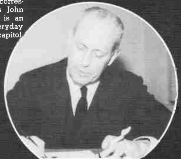
Fred Bate reports the news for WSOC-NBC from London.