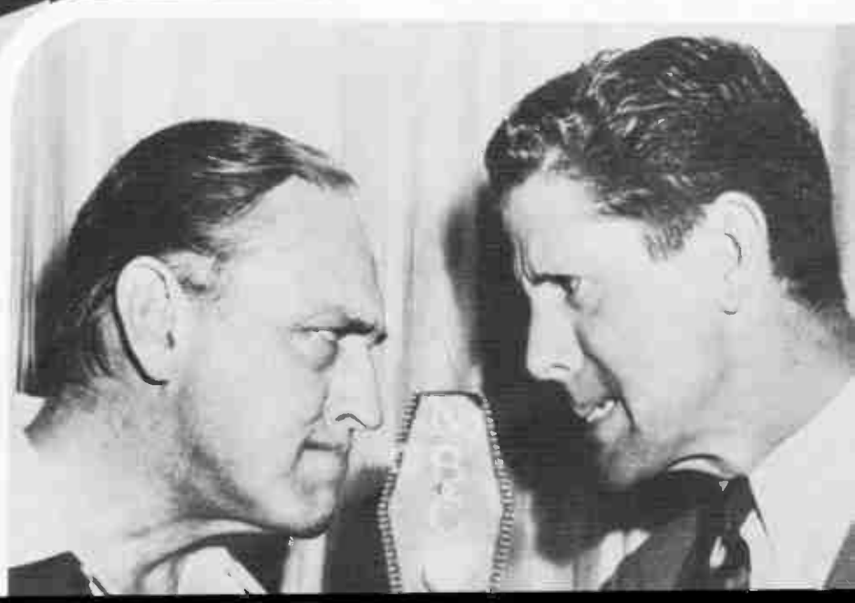
Right — The GREAT PROFILE and the CONNECTICUT YANKEE glower at each other . . . matching grimaces. John Barrymore and Rudy Vallee continue to panic WSOC-NBC listeners on their regular Thursday night show.