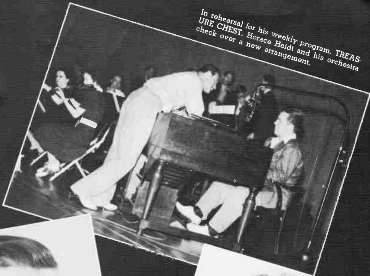
In rehearsal for his weekly program, TREASURE CHEST , Horace Heidt and his orchestra check over a new arrangement.