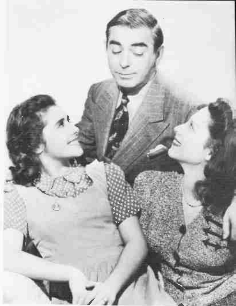
Comedian Eddie Cantor, heard on the TIME TO SMILE show, propells his charm in the general direction of two of his very charming proteges.