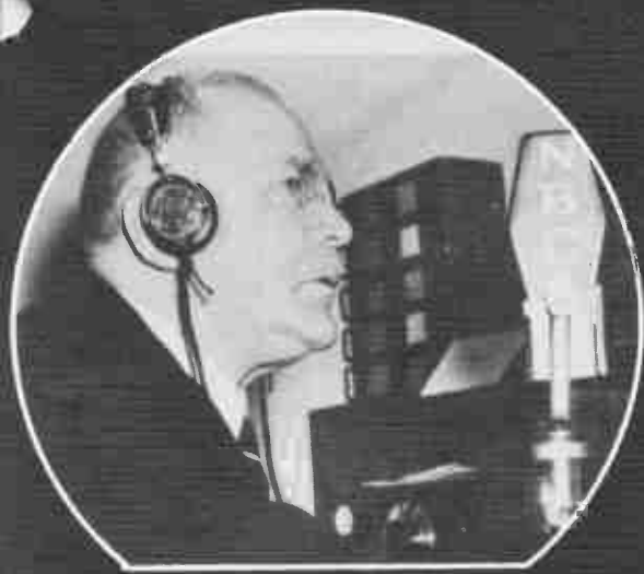
H. V. Kaltenborn is only one of WSOC's many distinguished commentators who interpret the news and inform the listeners as to what its occurrence might imply.