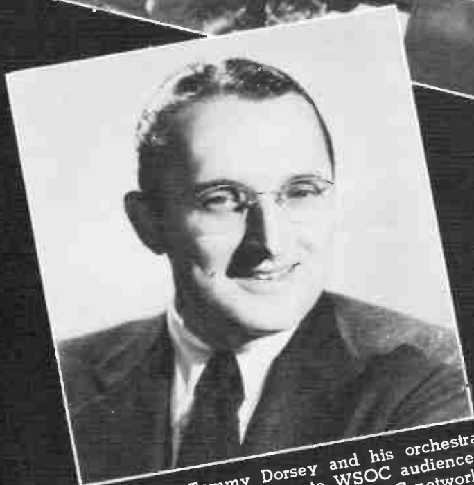
Trombonist Tommy Dorsey and his orchestra bring their smooth rhythm to WSOC audiences often through the facilities of the NBC network.