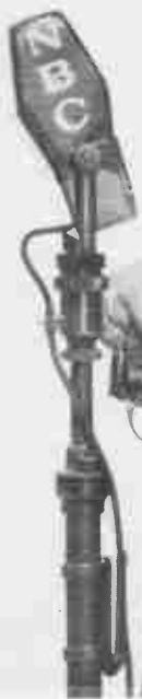
Dr. Walter Damrosch conducts the MUSIC APPRECIATION HOUR. This program, for adults as well as the younger music lovers, is an educational feature in the appreciation of finer music.