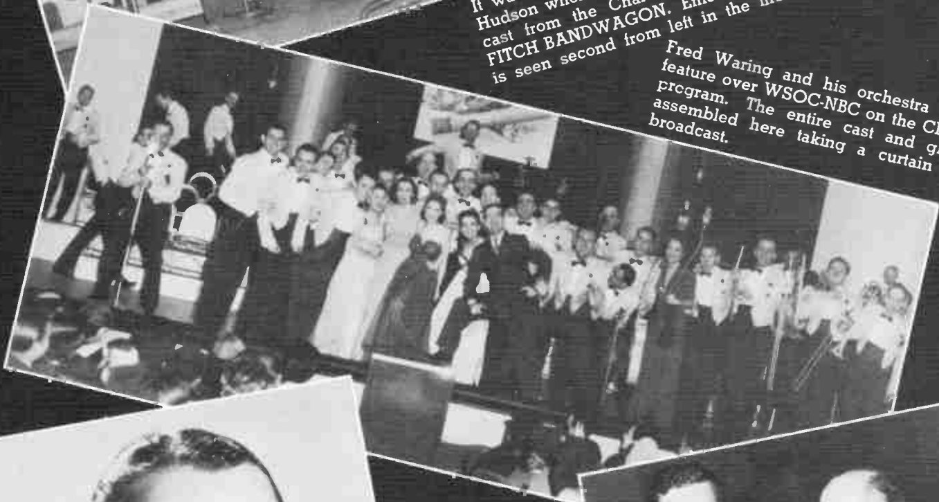
Fred Waring and his orchestra are a regular feature over WSOC-NBC on the CHESTERFIELD program. The entire cast and glee club are assembled here taking a curtain call after a broadcast.