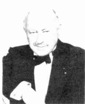
CECIL B. DeMILLE "Lux Radio Theatre"