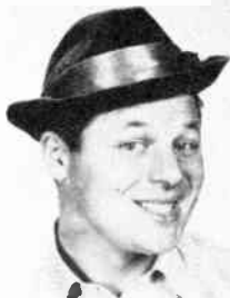
JACK CARSON "Jack Carson Show"