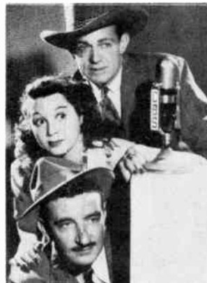
MEMBERS OF CAST "I Love A Mystery"