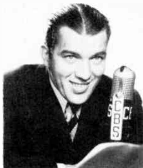
ED SULLIVAN "Mennen's"