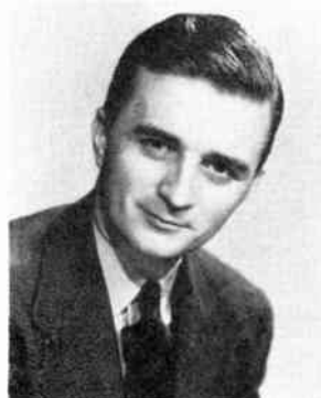
RANALD MacDOUGALL "Man Behind The Gun"