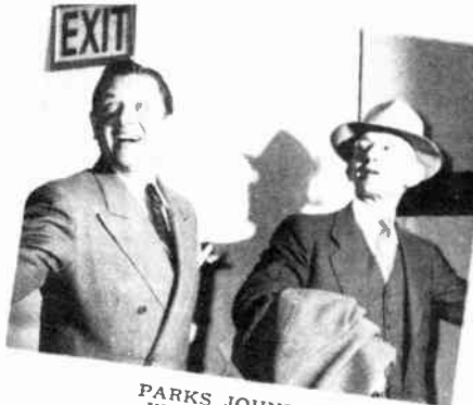
PARKS JOHNSON WARREN HULL "Vox Pop"