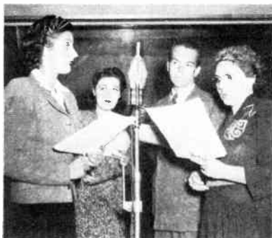
MEMBERS OF CAST "Young Doctor Malone"