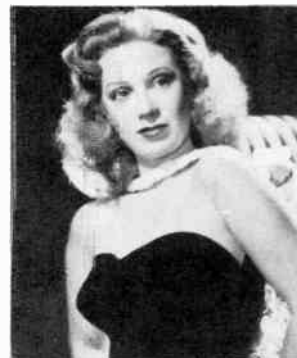
DINAH SHORE "Dinah Shore Show"