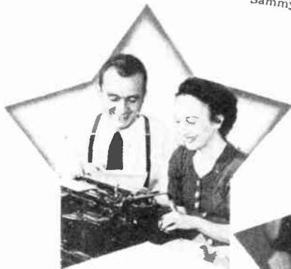
HARPO and TINY