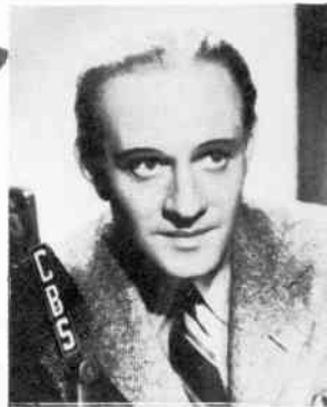
CONRAD NAGEL "Radio Reader's Digest"