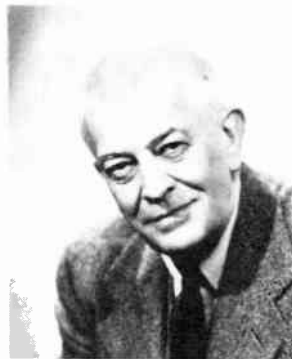
CARL VAN DOREN "New York Philharmonic"