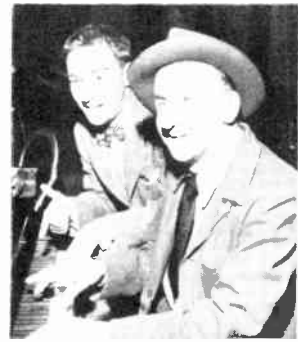
JIMMY DURANTE and GARRY MOORE "Durante-Moore Show"