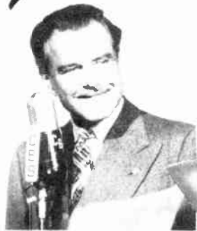
BERT LYTELL "Stage Door Canteen"