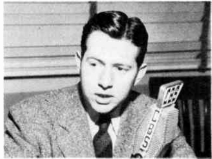
DOUGLAS EDWARDS "Report To The Nation"