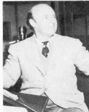
ANDRE KOSTELANETZ "The Pause That Refreshes"