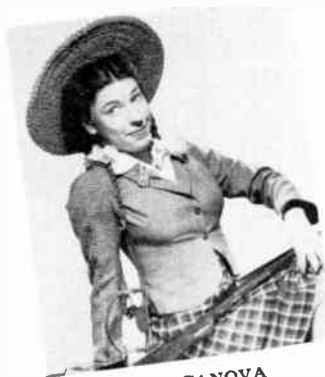
JUDY CANOVA "Judy Canova Show"