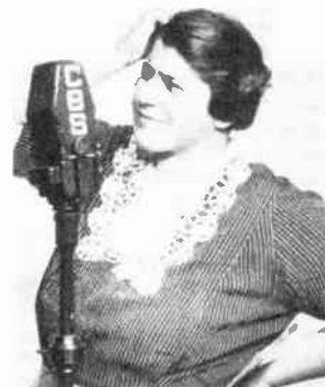
GERTRUDE BERG "The Goldbergs"