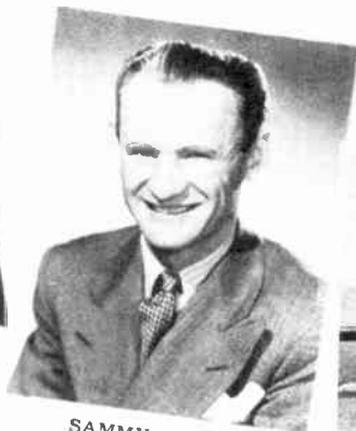
SAMMY KAYE "Sammy Kaye Show"