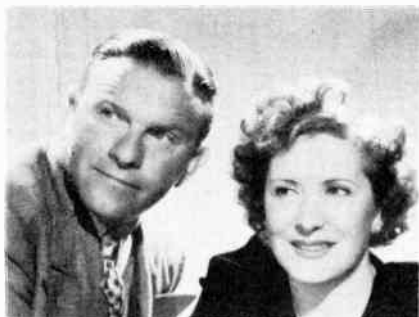
GEORGE and GRACIE "Burns and Allen"