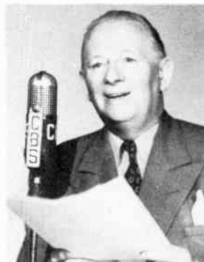
JACK MacBRYDE "The Old Ranger" "Death Valley Days"