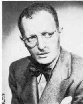
Dr. BENJAMIN ORDWAY "Crime Doctor"