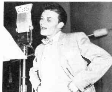
FRANK SINATRA "Hit Parade"