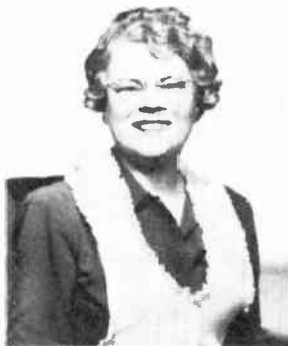
AUNT JENNY "Aunt Jenny's Real Life Stories"