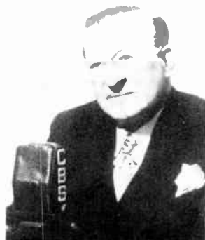
MAJOR BOWES "Major Bowes Show"