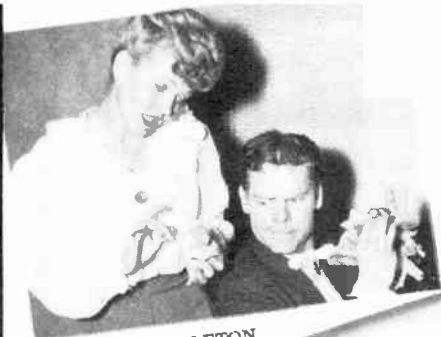
PENNY SINGLETON ARTHUR LAKE "Blondie"