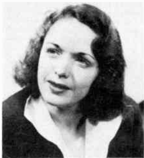
JULIE STEVENS "Kitty Foyle"