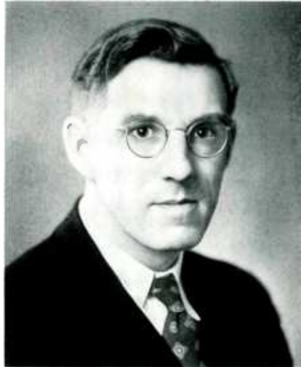
Filmer Hubble, Conductor

But what is audible and visible to the audience is but a fraction of the abundant, exciting things happening during rehearsals, broadcasts and public performances. Girls and boys, no matter what nationality or creed, mix in the one great universal language they love so well. These young people are to be envied, for how many of us had the opportunity and direction afforded them to establish definite listening habits and to learn to spot the dominant musical ideas? The fine informational backgrounds built up by their conductors