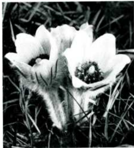
Prairie Anemone (Crocus) Floral Emblem of Manitoba