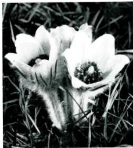
Prairie Anemone (Crocus) Floral Emblem of Manitoba