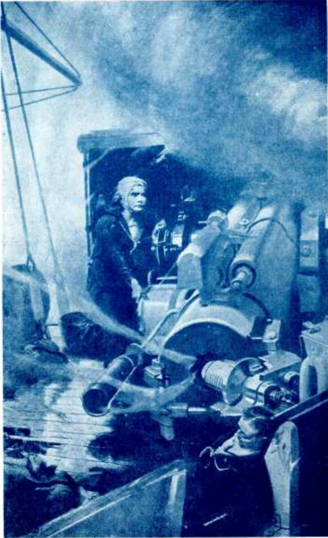
BOY (FIRST CLASS) JOHN TRAVERS CORNWELL, V.C.

Painted for the Admiralty by Frank O. Salisbury