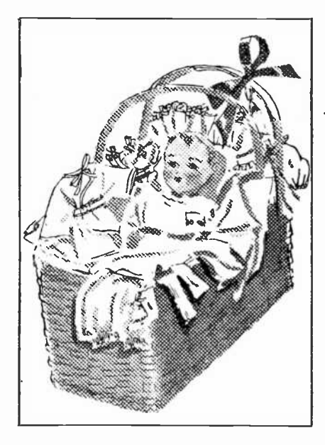
One of our own creations. Baby Doll in basket layette. $4.94

Make this the brightest, merriest Christmas that the children have had in years. Prices are low. A whooping big Christmas, with plenty of presents for everyone, will cost no more than a very meagre Christmas cost two or three years ago.