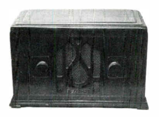
Zenith Model 701, Circa 1933 AC-DC Mantle Superhetrodyne.