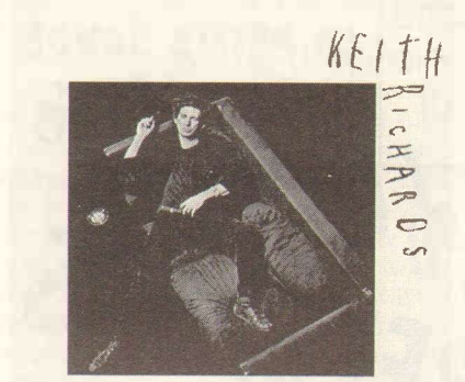
HATE IT WHEN YOU LEAVE