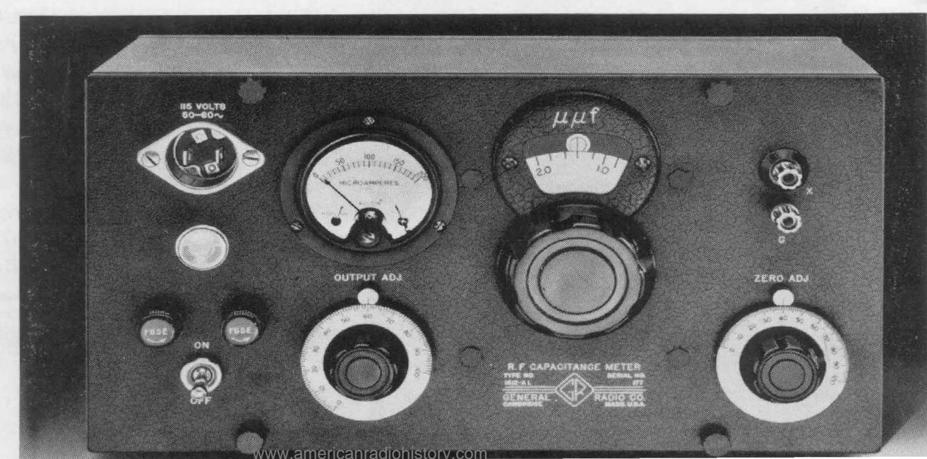
Figure 1. Panel view of the Type 1612-AL R-F Capacitance Meter, showing open capacitance scale at low end of range.

be found in the electron-tube-socket standardization work which has so far produced Standard TR-111 in the Transmitter Section and will, in the near future, produce a Receiver Section Socket Standard. Even before TR-111 actually was issued, and while it was going through the successive steps required for standardization, committee work was going forward on extensions and revisions of TR-111 to keep the standard alive and abreast of the times.