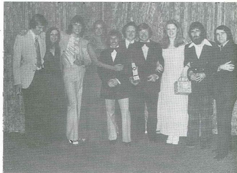
RCA's Juno winning national promotion crew (1973).