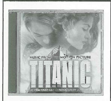
MY HEART WILL GO ON Celine Dion 5050 Music/Sony-H