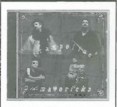
THE MAVERICKS Trampoline MCA Nashville - 70018-J