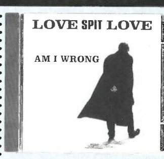
AM I WRONG Love Spit Love Imago