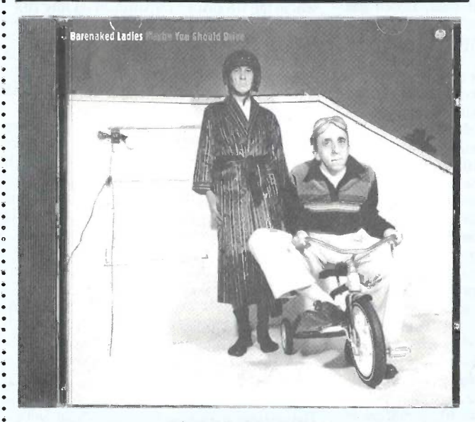
BARENAKED LADIES Maybe You Should Drive - Sire/Reprise - CDW 45709-P