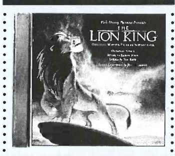
THE LION KING Soundrack Disney - 60858