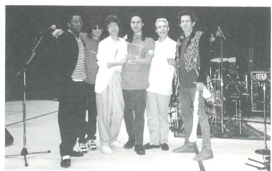
The Rolling Stones, in Toronto rehearsing for their upcoming Voodoo Lounge tour, receive their own copy of the new Voodoo Lounge album from a Purolator courier. HMV had set-up a 5-V00D00 phone line for those who wanted personal home delivery of the album the day before the album hit the stores across the nation. The Stones took advantage of the "ultimate in customer service" and snatched a single copy of the disc.

The 840-acre Woodstock site in Saugerites, New York will also contain Eco-Village, an area "dedicated to socially conscious organizations representing issues ranging from AIDS to the environment.