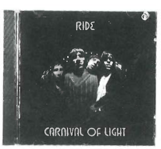
RIDE Alternative Carnival Of Light Sire/Reprise 45610-P

like someone knocking a pesky fly of their shoulder. Bands such as UB40 have never failed to have commercial success, but critics have always looked at them with the crotchety disdain they used to wave at country acts. That may be slowly changing, and bands like One are the vanguards of the changing attitude. One is a Toronto-based eight-member band that Virgin is hoping will be the first in a series of successful new domestic signings. The music is upbeat, bouncy pop with that reggae beat that should appeal to club DJs everywhere. This is the kind of music that gets everyone in the place on the dance floor, and success in the clubs should spinoff to success on the charts. With lots of boppy horns, shuffling beats and chiming guitars, Smokin' The Goats could easily find itself a shelf space beside the latest UB40 release.