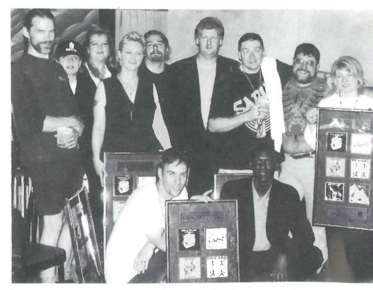
Warner staff presented Spirit Of The West with plaques honouring the band's 10th anniversary and recently-achieved gold status for the Go Figure album, following their sold-out show at Vancouver's Commodore Ballroom.