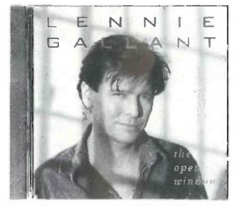
1 ENNIE GALLANT · Country/Pop The Open Window Columbia-80196-H

There is a moment in the midst of the anthemic Won't Get Fooled Again when Roger Daltry lets out the scream of all screams, the kind of scream that Robert Plant would have died for. Then the guitars and drums kick in, and Daltry announces to an unsuspecting world, "Meet the new boss..." That moment didn't signify the beginning of rock, but it certainly gave crystal clear evidence of what it's all about. And it gave clear evidence of what The Who was all about - move out of the way, get out of our face, or we'll kick your ass. The Who was punk's attitude before punk was even rumoured · it was grunge's ethic before Eddie Vedder was walking erect. Try as they might to condemn them, rock critics could never deny the band's status as rock and roll rebels of the first degree. This four CD set was produced by Chris Charlesworth, Jon Astley and Bill Curbishley, and features the rare odds and ends that true fans want to see in a box set, along with classics such as I Can't Explain, Baba O'Reilly and the aforementioned Won't Get Fooled Again. Comes complete with a nice thick book detailing each track, with an introduction from Pete Townshend, A good overview of an essential cog in the rock and roll machinery.