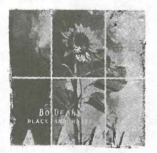
BODEANS -Rock Black and White Slash/Reprise - CD 26487

Perhaps when the song Perpetual Change was introduced on their classic album, The Yes Album, Jon Anderson and Chris Squire knew something the rest of us didn't. Certainly through the two decades of its existence, the band has gone through tremendous changes and this latest project seems to reflect them guite accurately. Union is a celebration of the original cast which combines the best of classic Yes with the best of modern Yes, Interestingly, the material is a combination of works scheduled for separate ABWH and Yes albums penned individually before the bands came together. Already doing well at radio, Yes continues to sell out concerts and has. done so, even prior to the album's release. (CD reviewed) - RW