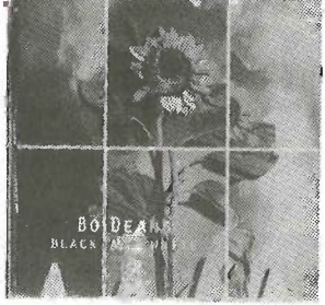
BODEANS Black And White Slash/Reprise - CD-26487-P