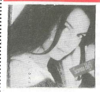
UNCONDITIONAL LOVE Susanna Hoffs Columbia