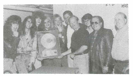
It was a Dirty, Rotten, Filthy, Stinking, Rich award, but it was gold for Warrant, presented by CBS staffers, who also informed the band that the album had just gone platinum as well.