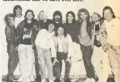
MCA's recording band, Blvd. get together with members of Boston after Vancouver date.

"People in Canada," Healy concludes, "don't have tunnel vision. They're far more open to music than people are here. Music in England, and Ireland, is all very fashionable and trendy. If you like a certain type of music, then you're not allowed to like another particular type. Whereas in North America, everything is rock 'n' roll. It's all under one big umbrella, with none of the subdivisions that we have over here."