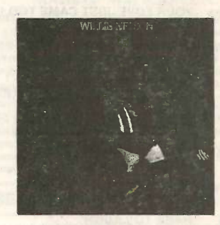
Single: Spanish Eyes (with Julio Iglesias)