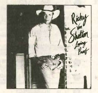
Single: I'll Leave This World Loving You