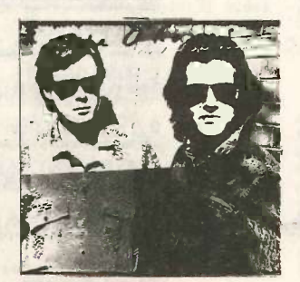
Single: Rocky Road