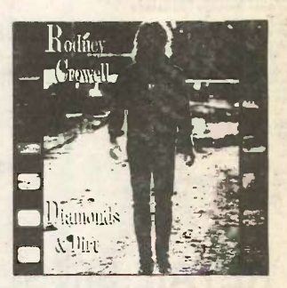
Single: She's Crazy For Leavin'