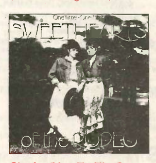
Single: Blue To The Bone