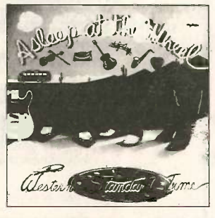
Single: Hot Rod Lincoln