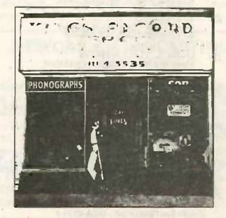
Single: Runaway Train