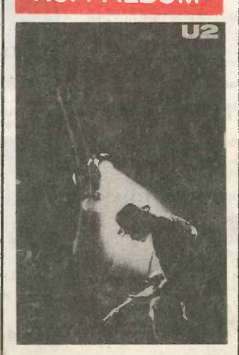
112 Rattle And Hum Island - ISL-2-1204-J