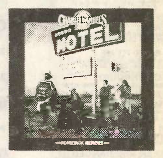
Single: Boogie Woogie Fiddle Country Blues