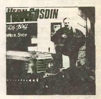
Single: Chisled In Stone