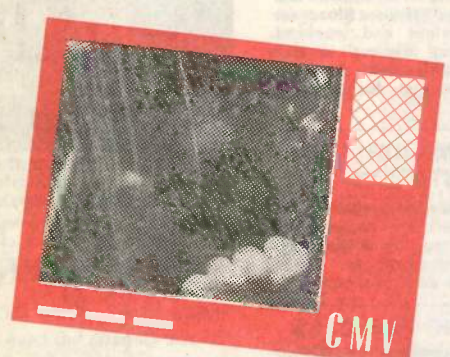
GEORGE MICHAEL Faith

*Contains 5 videos including "Monkey", plus exclusive interview footage!