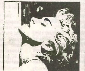
MADONNA True Blue Sire 92 54421-P