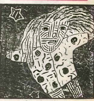
BONNIE RAIT Nine Lives Warner Bros - 92-54864-P