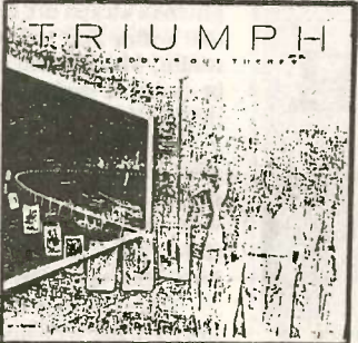
SOMEBODY'S OUT THERE Triumph MCA - 52898-J