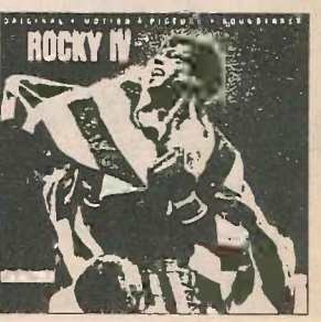
ROCKY IV Soundtrack Scotti Bros - SZT-40203-H