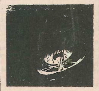
DIRE STRAITS Brothers In Arms Vertigo - VOG-1-3357-Q