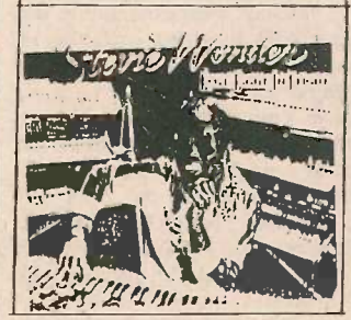
PART TIME LOVER Stevie Wonder Tamla - T-1808-M