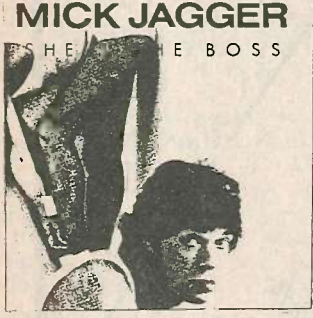
MICK JAGGER She's The Boss Columbia - FC-39940-H