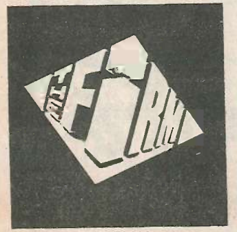
THE FIRM The Firm Atlantic - 78-12394-P