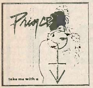
TAKE ME WITH U Prince Warner Bros - 92-90797-P