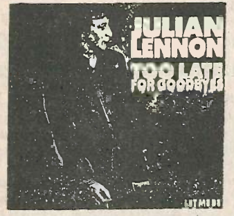
TOO LATE FOR GOODBYES Julian Lennon Atlantic - 7-89589-P