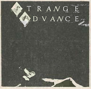
STRANGE ADVANCE 2WO Capitol - 4XT-12349-F