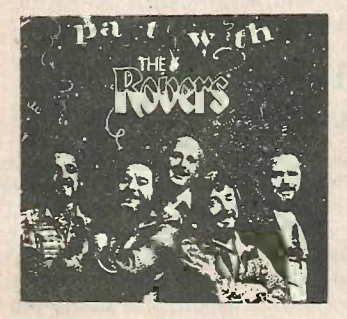
THE ROVERS Party With The Rovers Attic - LAT-1205-W