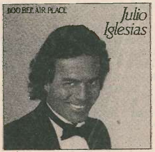
JULIO IGLESIAS 1100 Bel Air Place Columbia - FC-39157-H