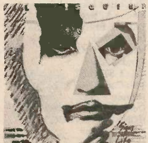
BILLY SQUIER Signs Of Life - Capitol JS-12361