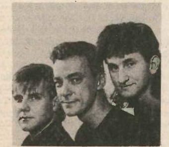
THE BODY ELECTRIC Rush - Anthem ANS-059