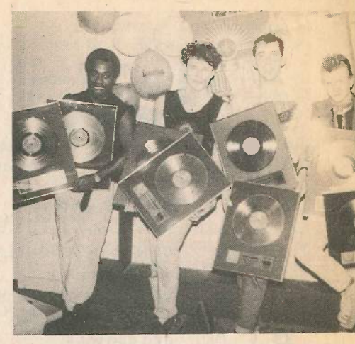
Following Big Country's sold-out date at Montreal's Le Spectrum, PolyGram Canada presented the group with gold and platinum for The Crossing album. Canada is the first territory in the world where Big Country has achieved platinum status on the album.

On February 24th, 1984 the Canadian music industry celebrates its 20th anniversary RPM was there the day it began