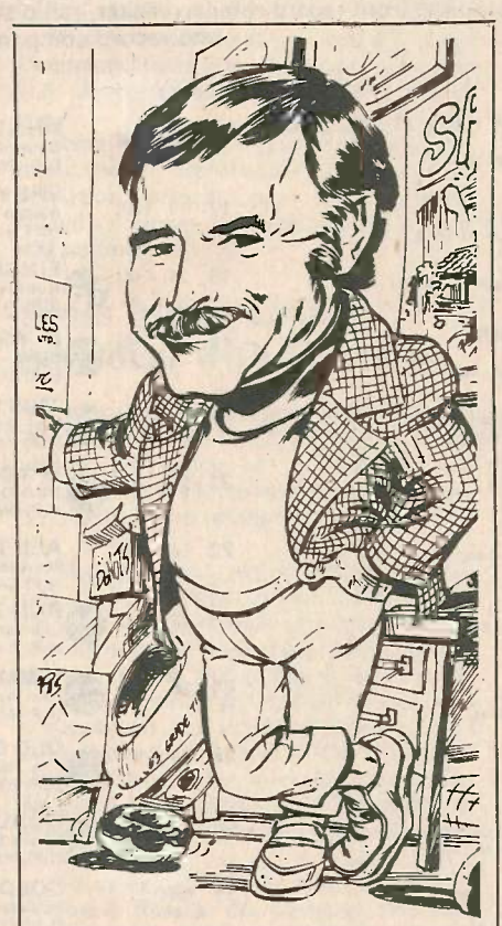
RPM would like to thank everyone who made the Pindoff Banquet a great success, proving that "when the industry gets together, they really get together."

The sixth annual CFMO/Citizen Christmas Exchange Broadcast, held in Ottawa (Dec. 4) raised a record-breaking $62,100. The broadcast originated from the offices of The Citizen and while CFMO on-air personalities and Citizen columnists anchored the telethon, pledges were read by 50 guest celebrities from government, television and religious circles. Also on hand were reps from the Ottawa Rough Riders and Ottawa 67's.