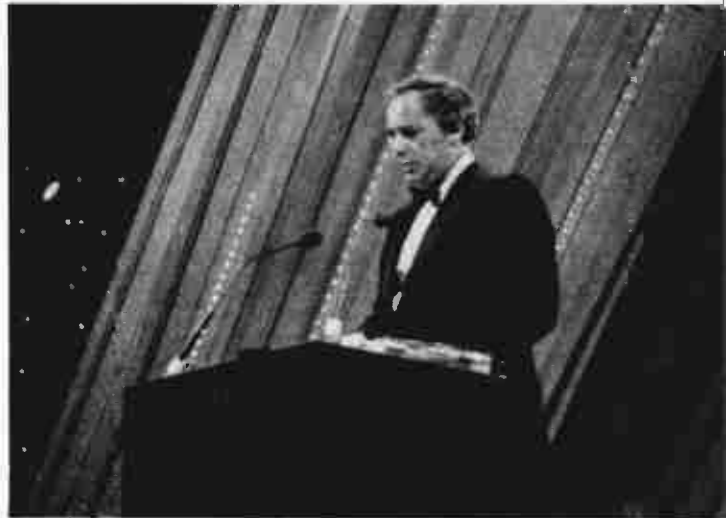
Governor-General Ed Schreyer pays tribute to the late Glenn Gould, posthumously awarding the internationally-acclaimed classical pianist the record industry's Hall of Fame Award.