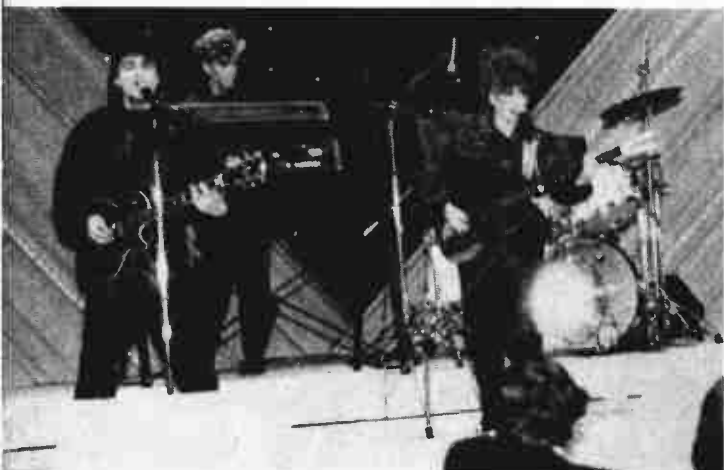
Ready recording group, The Spoons, performing at this year's Junos. Their album, Arias & Symphonies has now gone gold.