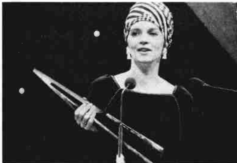
Liona Boyd, CBS recording artist, maintains her hold on the Instrumental Artist of the Year Juno. She also won this coveted award in 1978 and 1981.