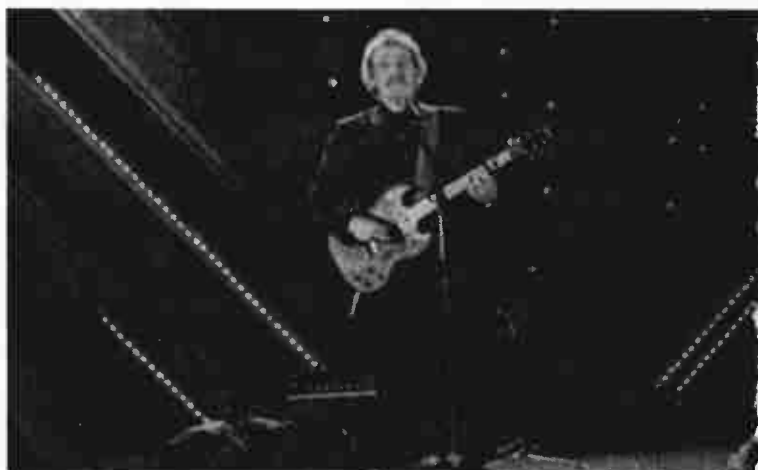
Gordon Lightfoot was a highlight of this year's Juno show, making one of his rare appearances on this type of show.