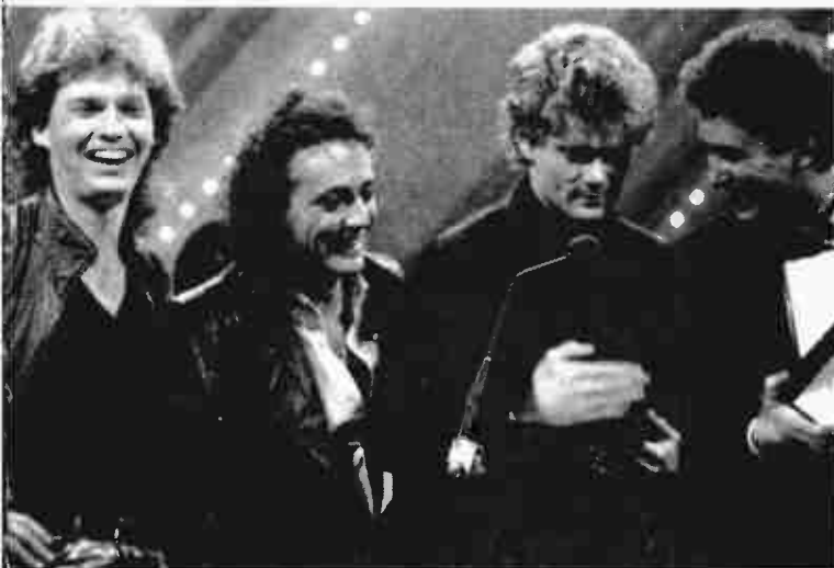
CBS recording group, Loverboy, accepting their Juno as Group of the Year, an honour they received last year as well.