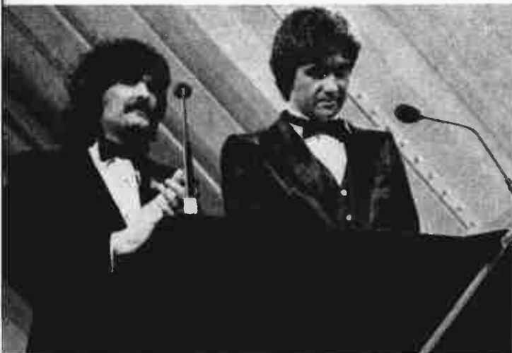
Co-hosts of this year's Juno Awards, Burton Cummings (l) and Alan Thicke. The latter has his own TV talk show.