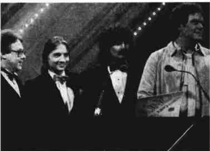
The Guess Who (Gary Peterson, Jim Kale, Burton Cummings, Randy Bachman) were surprise presenters. They are currently preparing a comeback and will open in Toronto (June 28).