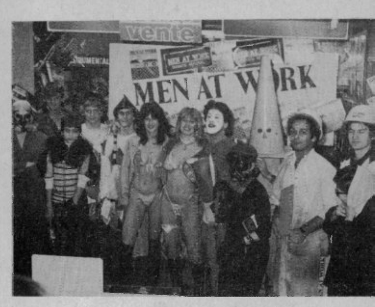
welders, secretaries, truck drivers, mimes, plain little old housewives and a couple of devoted to Men At Work strippers.