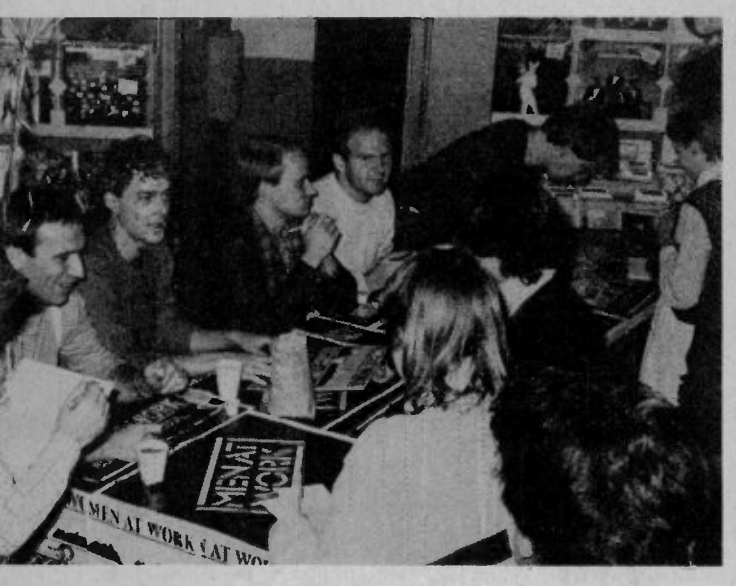
The CBS Come as you are campaign, attracted more than 1,000 Montreal fans to the St. Catherine Street Discus Store, including