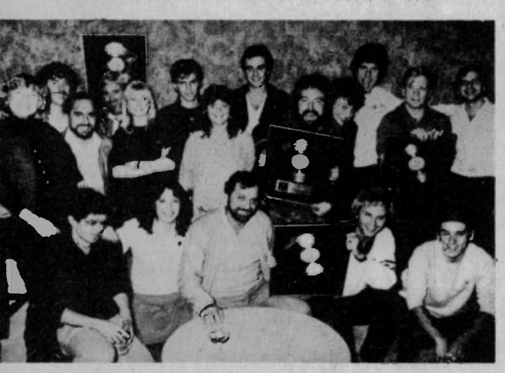
After their Toronto date, the Payolas were awarded their first A&M gold for their No Stranger To Danger album. Head office staff got together with the group for the presentation.