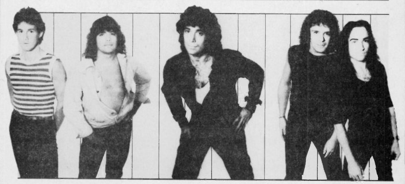
AVAILABLE ON MCA RECORDS AND CASSETTES

MAKE TRACKS TO YOUR FAVORITE RECORD STORE, NOW!!!