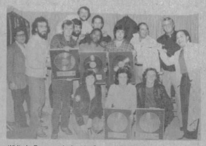
While in Toronto playing the Gardens, Red Rider were surprised when Capitol crowded into their dressing room to present them with gold aloums for their recent release, As Far As Siam.