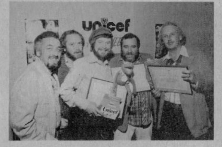
The Rovers with their UNICEF certificates of appreciation, presented at Hamilton Place (Oct 6) for their contribution to the success of fundraising and awareness program for the UN Fund.