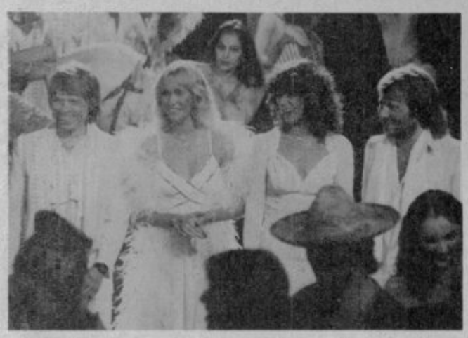
ABBA's latest album Super Trouper is their third consecutive album to go quintuple platinum in Canada. The Swedish quartet are celebrating their 10th Anniversary as a group and will be appearing in a forthcoming TV special taped in Stockholm.