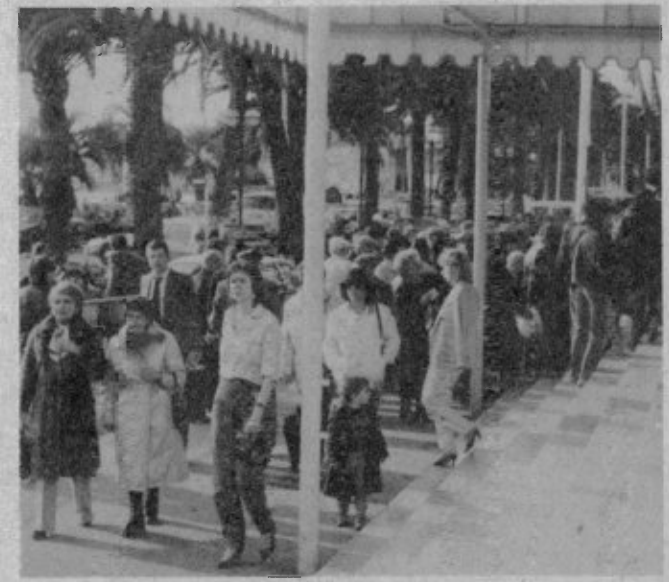
A portion of the large crowd that gathered daily outside the Palais des Festivals to watch for the MIDEM stars.