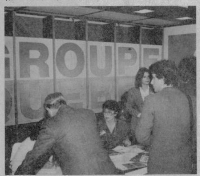
A portion of the busy Quebec booth.