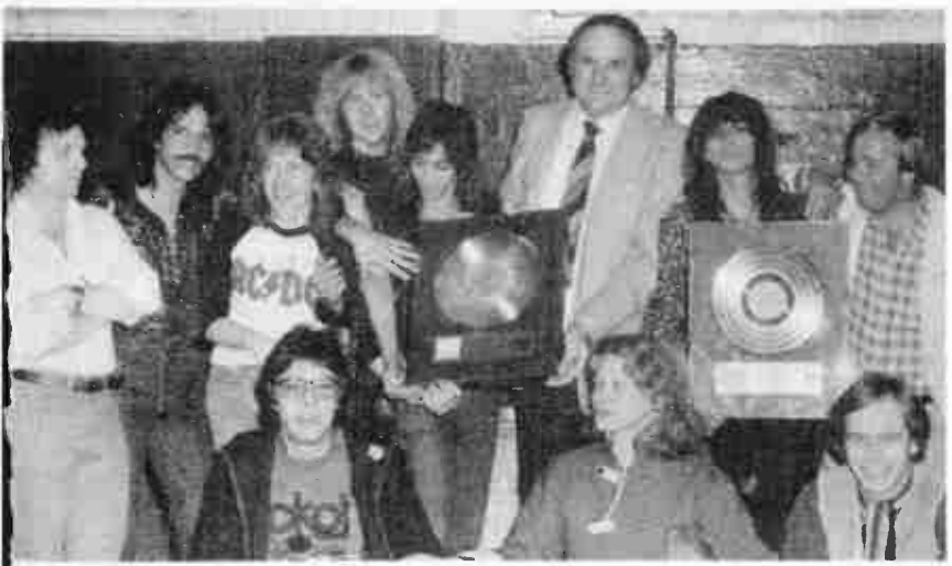
CBS recording group Aerosmith recently performed in Toronto before a sellout crowd at Maple Leaf Gardens. Backstage after the show, the group were presented with Canadian gold album awards for their current Columbia album, Night In The Ruts.