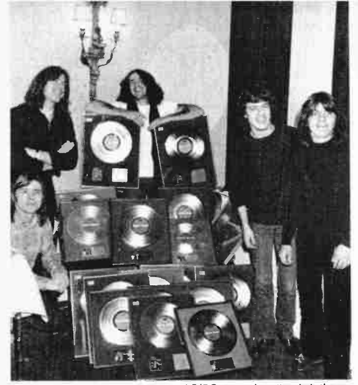
Australian heavy metal group AC/DC recently attended the MIDEM conference in Cannes, France. The Atlantic recording group were presented with multiple gold album awards for their current LP, Highway To Hell, from a number of countries, including the U.K., U.S. and Canada.