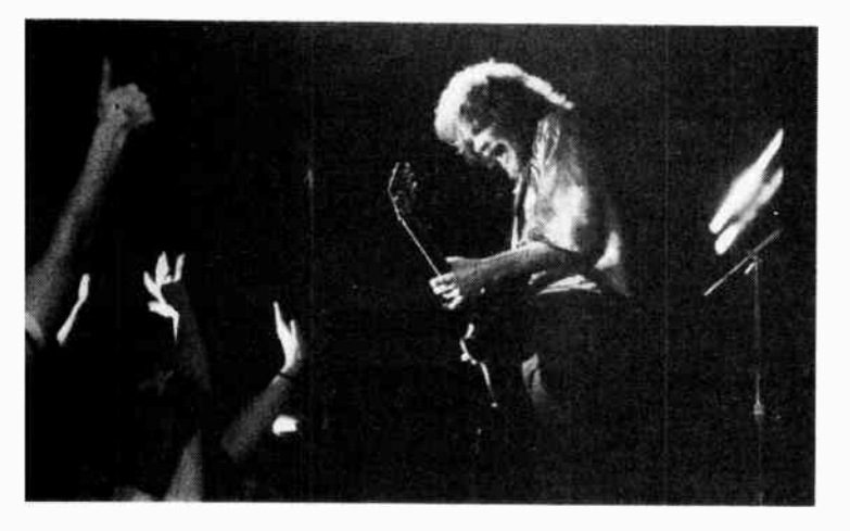
Doucette fans were out in force to welcome the west coast artist to the Ontario Place Forum.

Doucette's current single, Nobody, is pressently garnering heavy airplay on major Top 40 stations right across Canada.