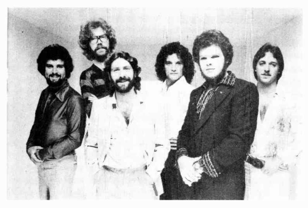
The Buffalo-based Spyro Gyra - a new breed of jazz instrumentalists