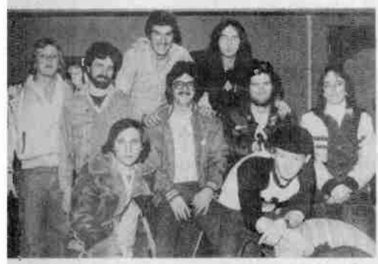
Members of GRT recording act FM appeared on Nite Dreams, at the Cable 10 TV studios while in Vancouver. The group is pictured with GRT staffers and Nite Dreams personnel.