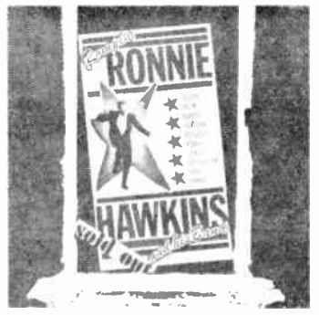
RONNIE HAWKINS & THE BAND) Sold Out - Roulette SR-42045-M Rock Re-issue of compilation of early hits 1st released as Greatest Hits. Features his group The Hawks (The Band).