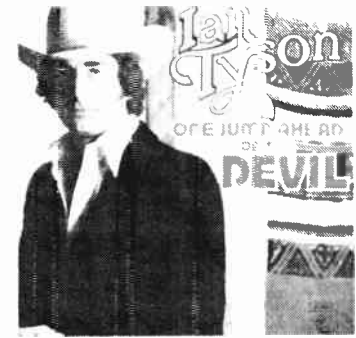
IAN TYSON One Jump Ahead Of The Devil - Boot BOS-7189-K Theme music from up-coming Chetynd western. Includes latest single Half Mile Of Hall.