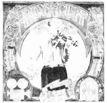
ROY ACUFF Greatest Hits Vol. 1 - Elektra/Asylum 9E302-P. 2-record set includes Wabash Cannonball, The Great Speckled Bird, Fireball Mail, Back in The Country.