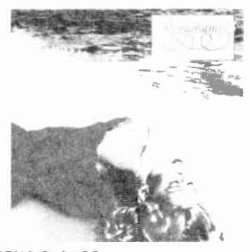
RENAISSANCE In The Beginning - Capitol SWBC-11871-F Reissue of group's 1st 2 LP's, Prologue and Ashes For Burning, Progressive, classical, folk and jazz elements.