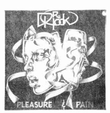
DR. HOOK Pleasure & Pain - Capitol W-11859-F Pop. Pleasant country rock sound. Incl. Sharing The Night Together 45. Top 40 appeal, possible country X-over.