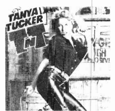
TANYA TUCKER TNT - MCA 3066-J Change of style for Tucker. Produced by Jerry Goldstein. Includes singles Not Fade Away and Texas When i Die.