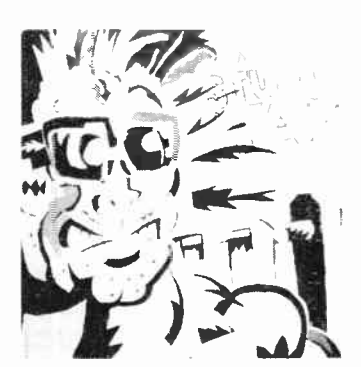
FRANK ZAPPA Studio Tan - Warner Bros. DSK-2291-P Jazz/rock/off-colour humour. New LP features another side-long slice of Zappamania & 1 short, 2 jazz pleces.