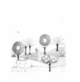
AL JARREAU All Fly Home - Warner Bros. BSK-3229-P Pop/jazz. New LP by vocalist/writer Jarreau shows his vocal dexterity thru elements of pop, soul/funk and jazz.