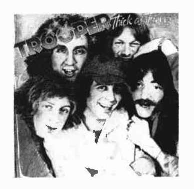
TROOPER Thick As Thieves MCA 237-J