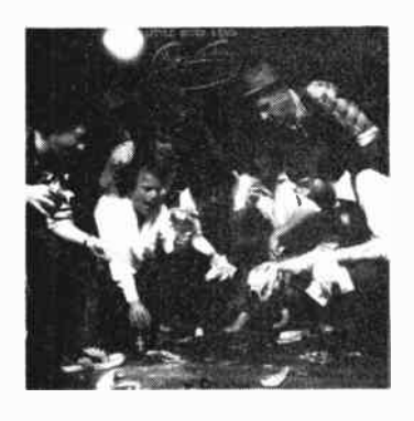
LITTLE RIVER BAND Sleeper Catcher Harvest SW-11783-F

the beautifully put together ballad, You Mean So Much To Me and the flat out rocker, We're Gonna Make It. Recorded at Winnipeg's Roade Recording Studios. Suggested list for album, $7.98 with 8-track and cassette at $8.98.