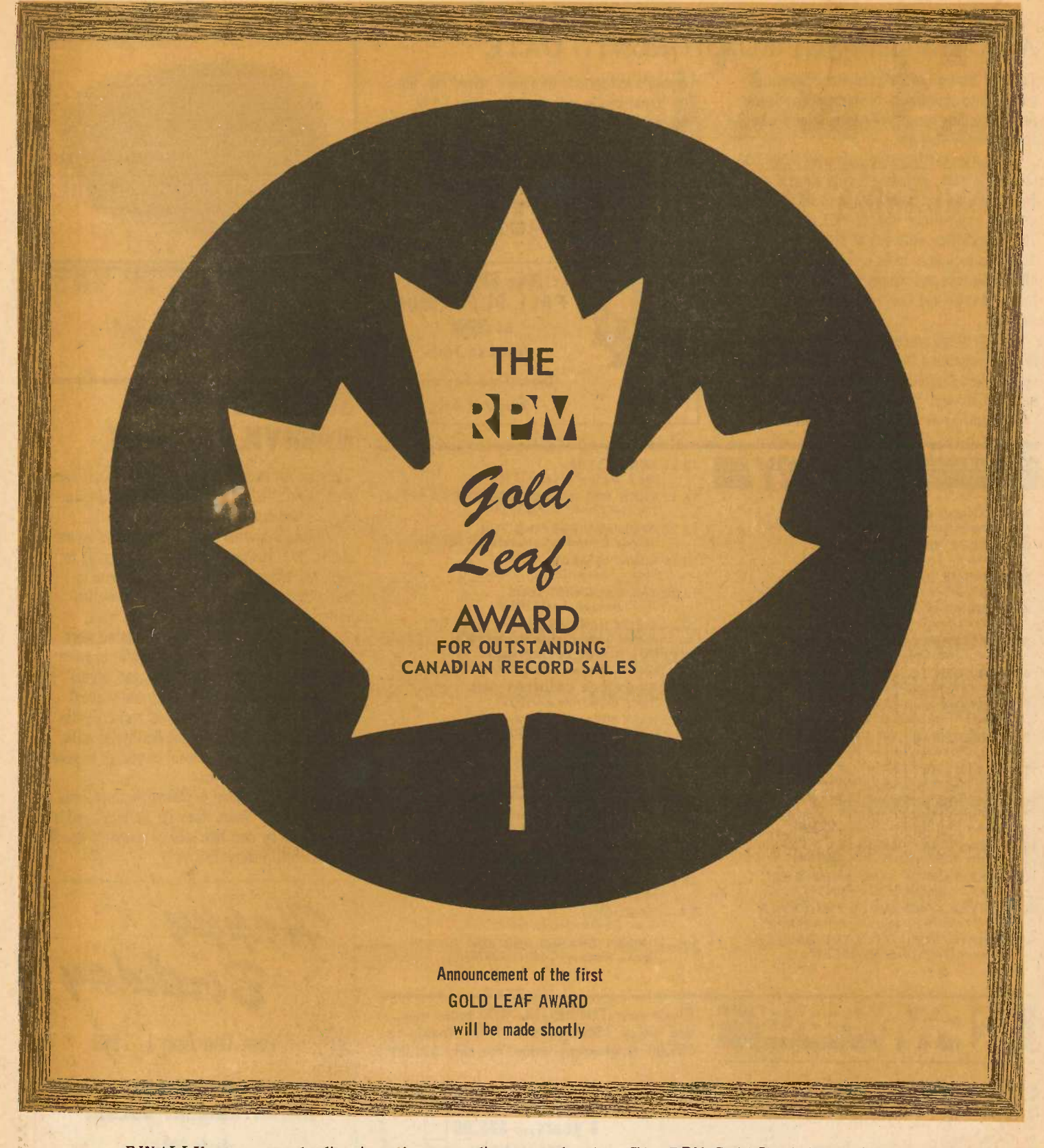
FINALLY.....a standardization of outstanding record sales. The RPM Gold Leaf Award is presented to record companies who have sold 50,000 LPs or 100,000 singles. This beautiful specially designed 10" by 12" or 14" by 16" plaque is an acknowledgement from the entire industry for an outstanding effort. For further information contact RPM if you feel that your record sales qualify for a Gold Leaf Award.