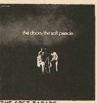
THE SOFT PARADE The Doors-Elektra-EKS 75005-C "Tell All The People", "Wishful Sinful" makes set hot sales and program item. Should be giant.