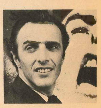
Gilles Vigneault 18-1F-0681