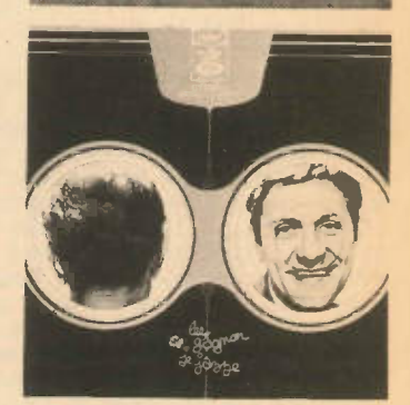
LE JAZZE-LEE GAGNON Capitol-ST 6253-F. An exciting jazz entry from Montreal's best. Excellent fare for international recognition. No language barrier, strictly music, and original.