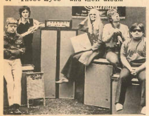
Three's A Crowd

The Winnipeg scene is also showing signs of a rebirth despite their lack of local radio support. The Guess Who are now making headlines with their Nimbus 9 Production of "These Eyes" and their album