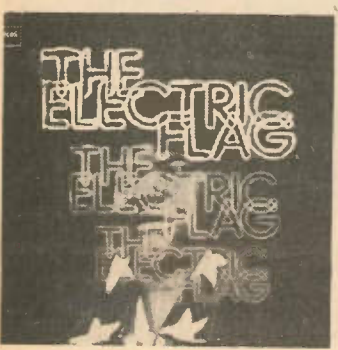
THE ELECTRIC FLAG Columbia-CS 9714-H. Just released but already receiving heavy airplay on underground and progressive AM. Group now split but should sell.