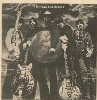
SAIL OR-STEVE MILLER BAND Capitol-ST 2984-F. Late in ar-riving but deserves mention. "Quicksilver Girl" now a single, and "Song For Our Ancestors" exceptionally strong.

SITTIN' IN AT THE COURT OF LOVE-UNIFICS Kapp-KS 3582-J. Under title of their recent charter, "Little Green Apples" sounds much better with a little Unific soul.