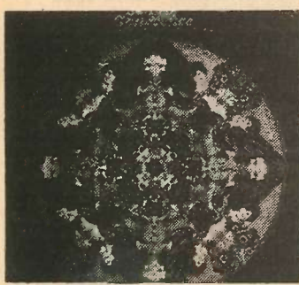
SONG OF INNOCENCE DAVID AXELROD-CapitoIST-2982-F A suite in seven parts inspired by writings of William Blake. Good material for AM stations with "progressive sound" for 'progressive sound' format. Instrumental.