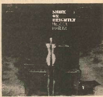
SHINE ON BRIGHTLY PROCOL HARUM-A&M-SP 4151-M Recent Canadian appearances should add potential to this album which includes all original material. Group maintains their classical-pop styling with some blues.