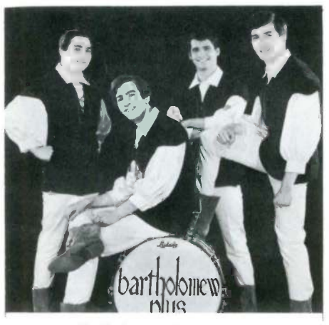
Bartholomew Plus III

Montreal: Thousands of Montreal teenagers gathered at Montreal's famed Forum to show their support of Canadian talent. Some of the