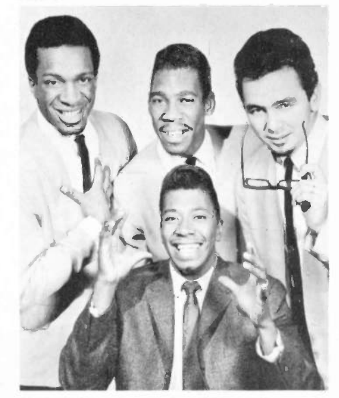
One of the most popular blues groups on the west coast, Little Doddie & The Bachelors are in the market for a recording session.