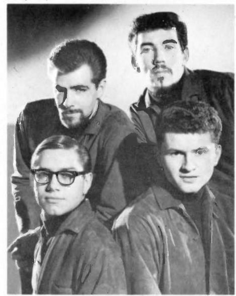
The Chessmen, Vancouver based foursome currently riding well with "The Way You Fell".