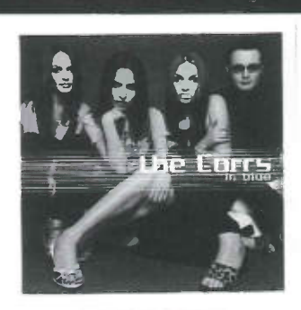
THE CORRS In Blue Atlantic - 83352-P