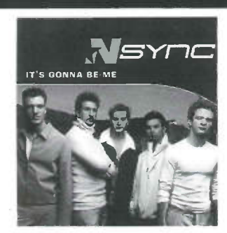
iT'S GONNA BE ME *N Sync Jive/Zomba-N