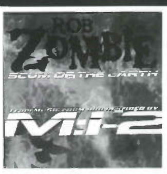
SCUM OF THE EARTH Rob Zombie Universal-J